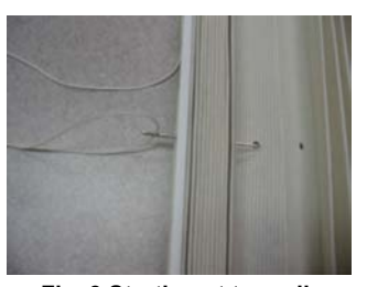
Fig. 3 Starting at top rail, thread string through holes as illustrated on diagram