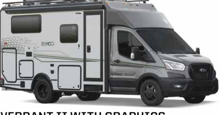
VERDANT II WITH GRAPHICS