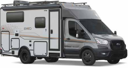
RAW SIENNA II WITH GRAPHICS