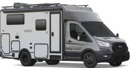
RAW SIENNA II