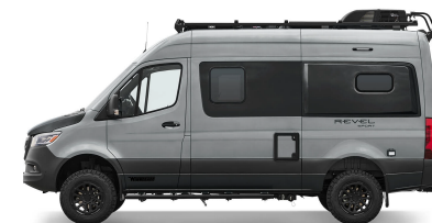
All exteriors available with optional RAPTOR® Tough and Tintable Protective Coating