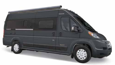
GRANITE DELUXE See dealer for details on all available colors