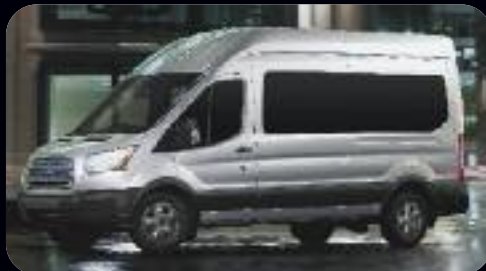
Ingot Silver exterior paint now available