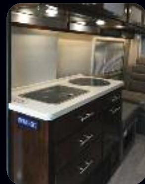
High Gloss Cherry cabinetry