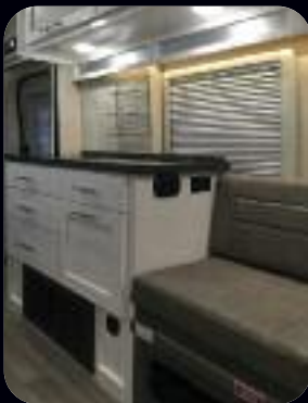
High Gloss White cabinetry

This versatile Class B motorhome is designed for today's active lifestyles. Experience unrivaled fuel economy combined with legendary Ford® styling and reliability. Relax in luxurious captains seats while enjoying the view through large frameless windows. The interior ergonomics ensure you are as comfortable on the road as you are at home. Crossfit gets you where the action is, in style!