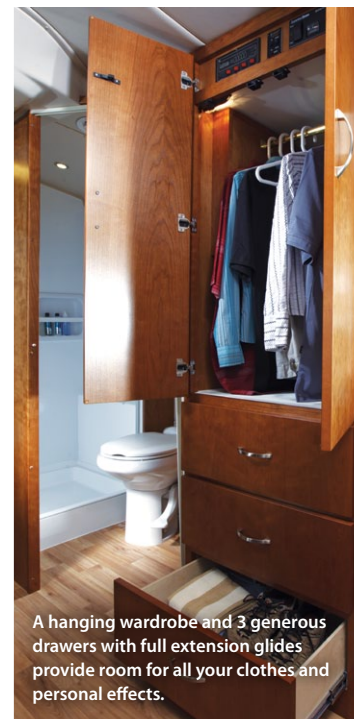
A hanging wardrobe and 3 generous drawers with full extension glides provide room for all your clothes and personal effects.