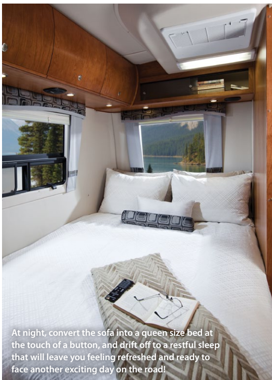
At night, convert the sofa into a queen size bed at the touch of a button, and drift off to a restful sleep that will leave you feeling refreshed and ready to face another exciting day on the road!