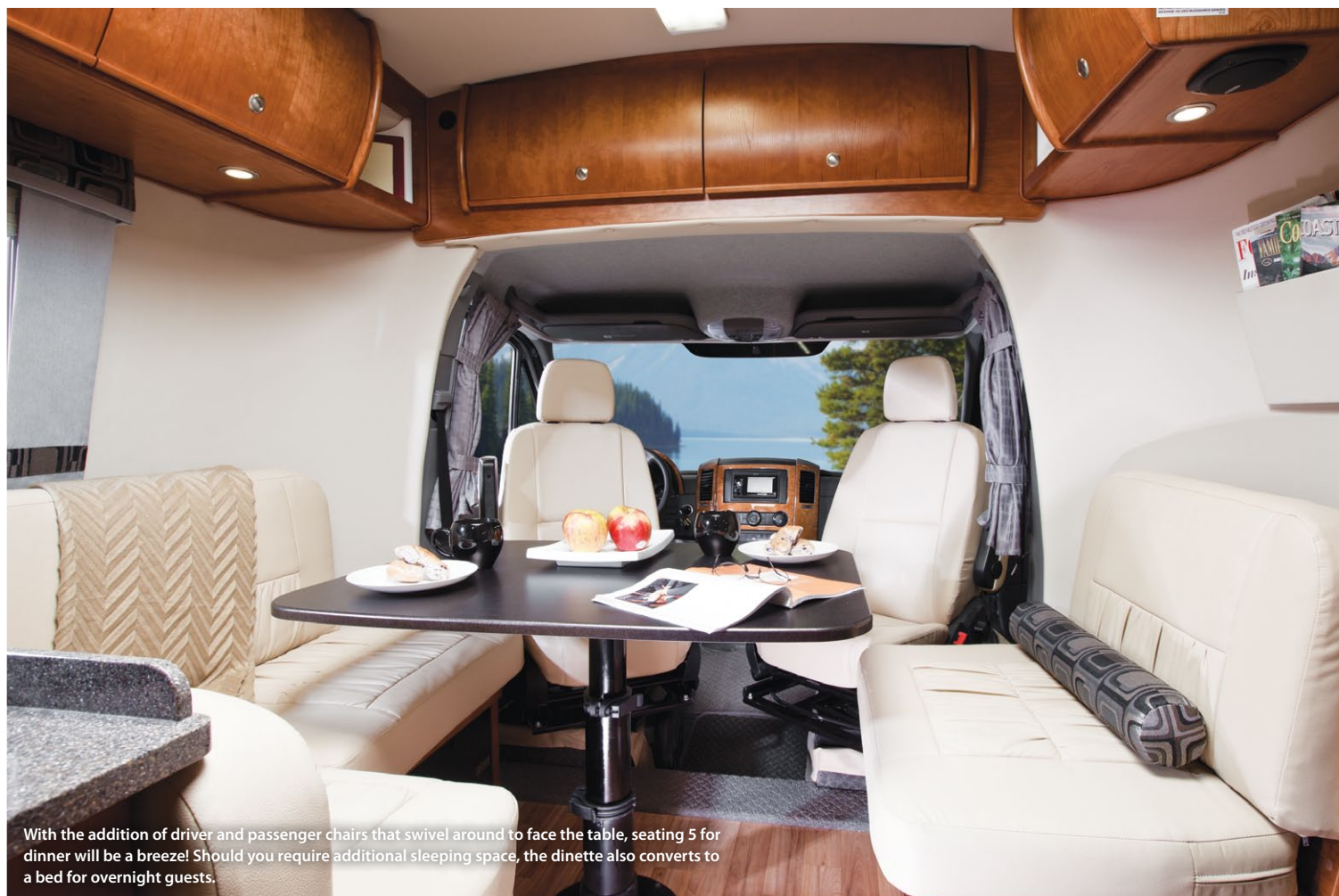
With the addition of driver and passenger chairs that swivel around to face the table, seating 5 for dinner will be a breeze! Should you require additional sleeping space, the dinette also converts to a bed for overnight guests.