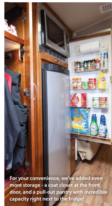
For your convenience, we've added even more storage - a coat closet at the front door, and a pull-out pantry with incredible capacity right next to the fridge!