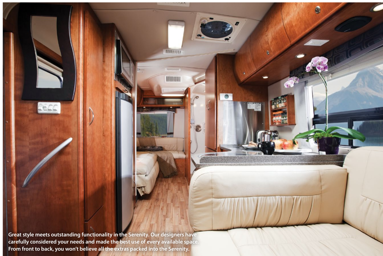
Great style meets outstanding functionality in the Serenity. Our designers have carefully considered your needs and made the best use of every available space. From front to back, you won't believe all the extras packed into the Serenity.