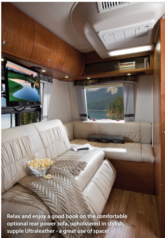
Relax and enjoy a good book on the comfortable optional rear power sofa, upholstered in stylish, supple Ultraleather - a great use of space!