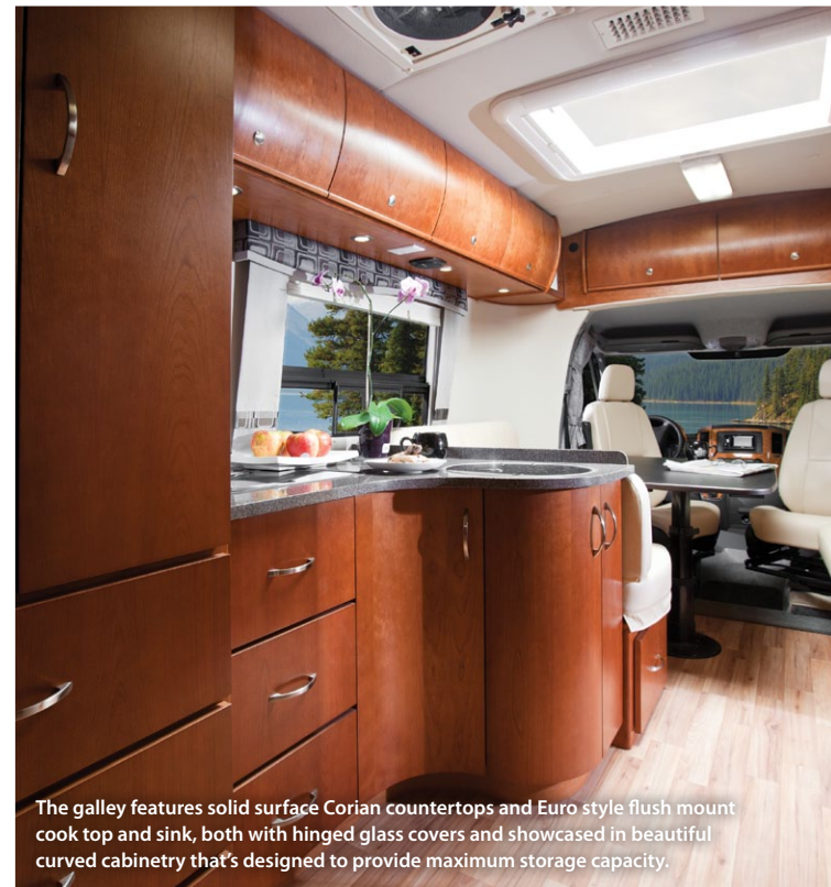
The galley features solid surface Corian countertops and Euro style flush mount cook top and sink, both with hinged glass covers and showcased in beautiful curved cabinetry that's designed to provide maximum storage capacity.