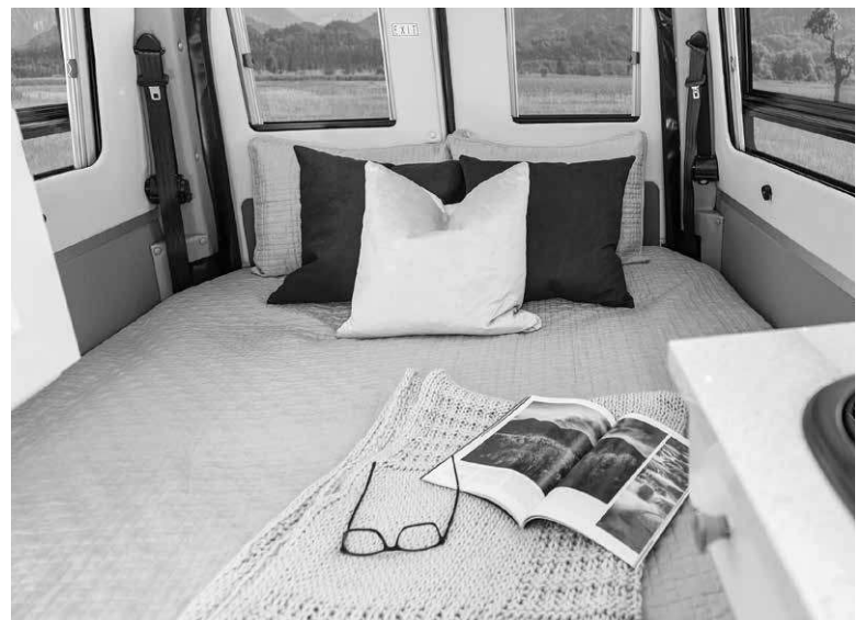
Rear lounge area easily transforms into a sleeping area with a comfortable king size bed.