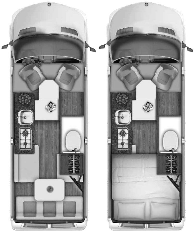
Interior floor plan daytime.