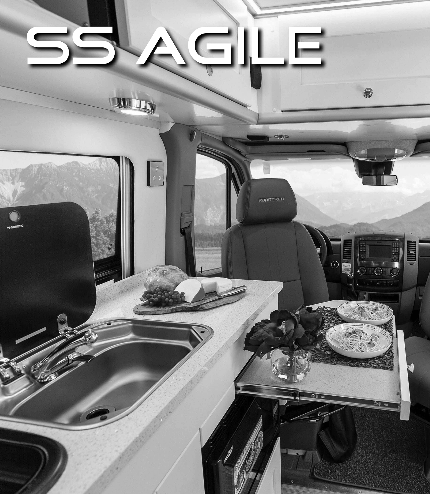
Spacious front dining area comfortably seats two.