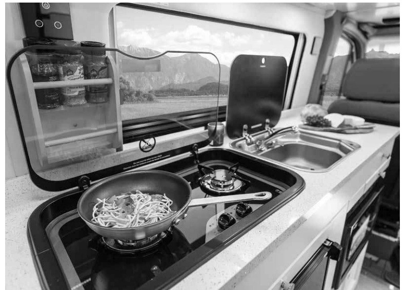
Expanded galley features a 3.1 cu. ft. refrigerator, convection microwave and 2-burner propane stove.