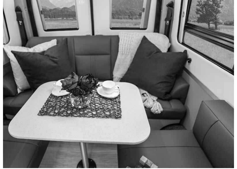
Rear lounge area is a comfortable place to sit, dine or relax and offers seating for up to three passengers.