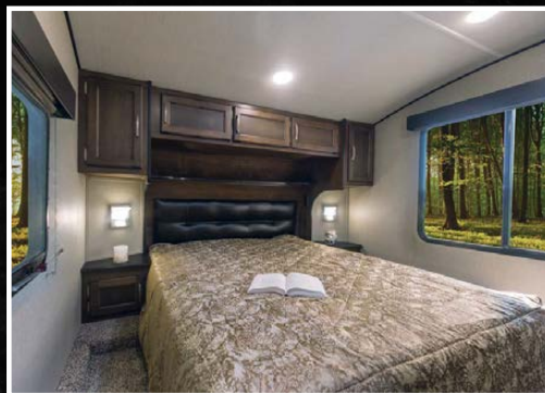
Residential Master Suite (230RL Shown)