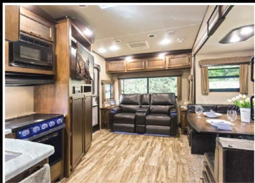
Spacious Living Area (230RL Shown)