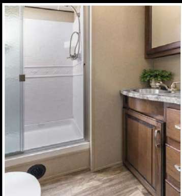
Spacious Master Bath (315RLTS Shown)