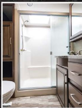
Spacious Master Bath (Bed slide models shown)

Nev-R-Adjust brakes, bronze bushings and wet bolts, rubberized suspension equalizer