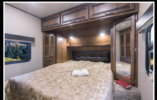
Residential Master Suite (297RSTS Shown)