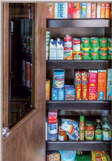
Class leading pantry storage

All-in-one heated location with EZ winterization system and exclusive siphon feature (Fresh tank)