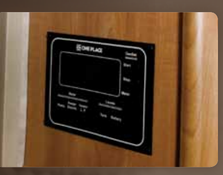
OnePlace <sup>®</sup> Easily monitor and control key on-board systems with the OnePlace systems center.

Visit us for the latest updates and expanded key feature content at: