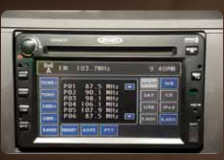
LCD Touch Screen The available RV Radio with 6.5" touch screen also displays the rearview camera images.