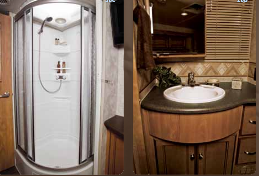
Shower The 30C shower features a skylight and an elegant textured-glass door. A self-cleaning retractable shower door is found in the 28B.