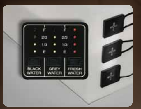
TrueLevel™ The TrueLevel holding-tank monitoring system uses sonar technology rather than probes that can clog or corrode so you'll have accurate readings every time.