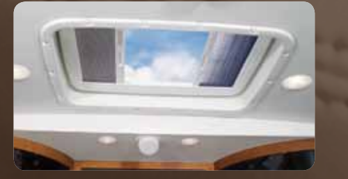
Skylight Brighten your day and stay cool with the available skylight/air vent that includes a shade and screen.

Rest Easy <sup>®</sup> At the press of a button, the available Rest Easy multiposition lounge glides from sofa to recliner to comfortable bed (30C).