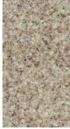
Matterhorn Corian Countertop