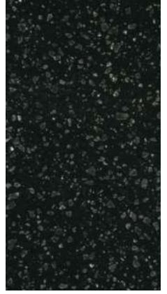
Night Sky Corian Countertop