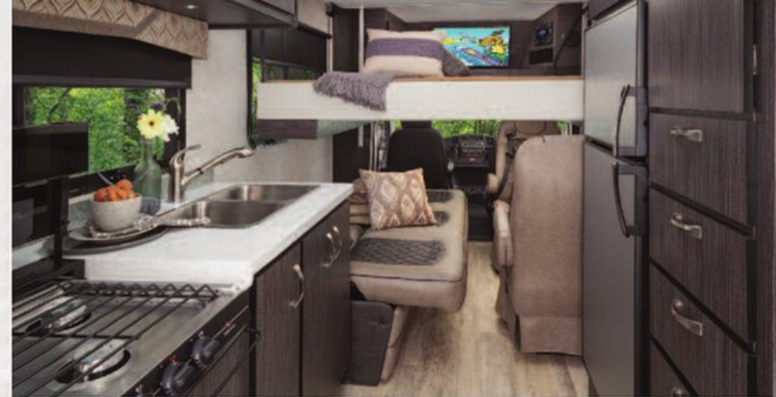
The clean, inviting interior has a spacious queen size electric drop down bed, a 32" LED TV and a convertible jack knife sofa.

Prices, floorplans and specifications subject to change without notice.