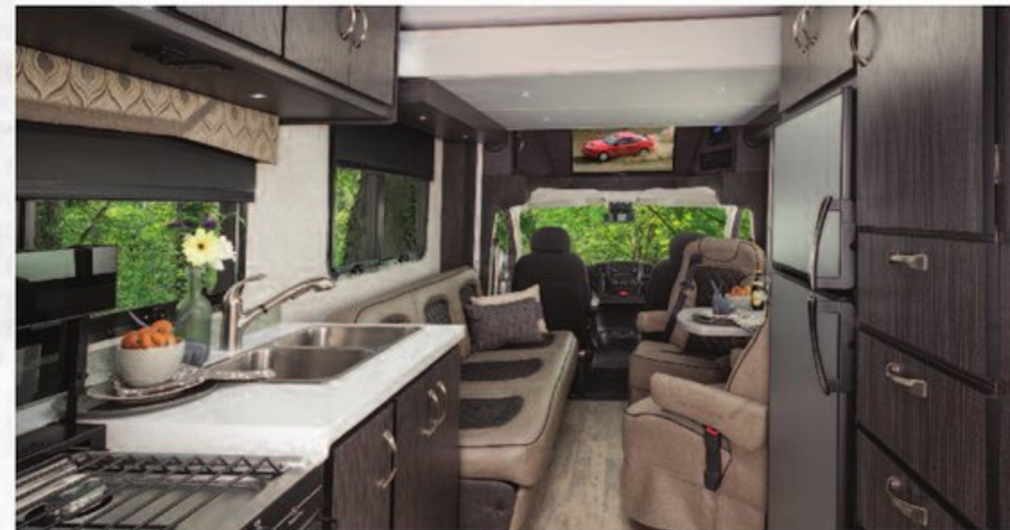
The well appointed galley has a three burner stove top, a seven cu. ft. refrigerator, a solid surface countertop, a tankless hot water heater and plenty of storage.