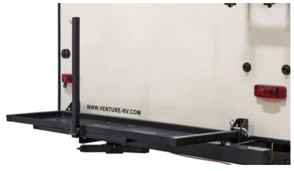
Bike rack/cargo tray with 250-pound capacity (option).