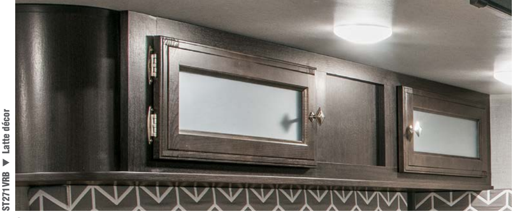
SportTrek's interior ceiling height is 82 inches, and the slideout height is 72 inches. Overhead slide cabinets provide easy places to store extra items.