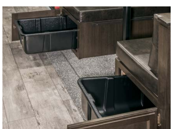
No space is underutilized. Even the dinette seats conceal easyaccess storage areas. The Stown-Go totes can be taken in the house and loaded. then returned and stored under each dinette seat.