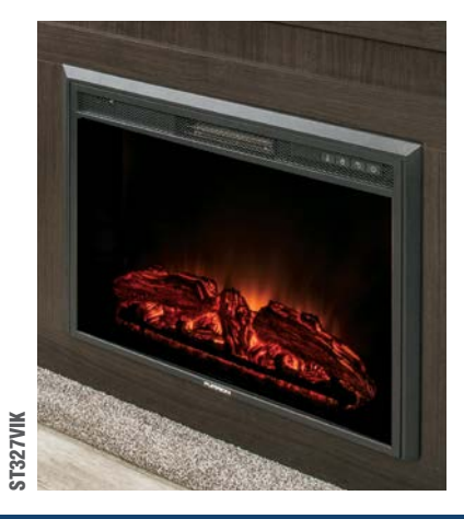
The optional 5,500 BTU electric heat fireplace adds a cozy ambience, taking the chill off those early morning and late evenings.