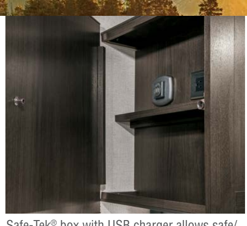
Safe-Tek® box with USB charger allows safe/ hidden charging for your electronic devices, and removes countertop clutter.