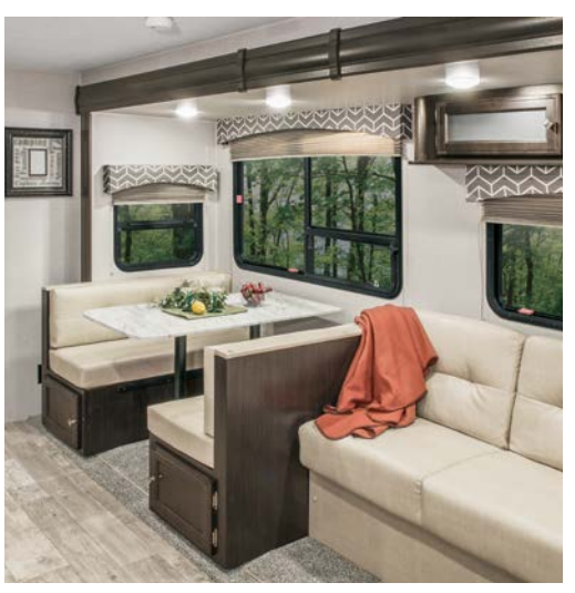
With a generous 72 inches of headroom, this slide-out offers plenty of added room for a large Comfort by Design® grand dinette for family dining.