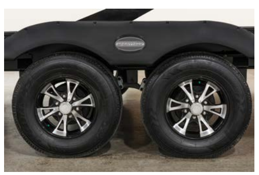
Optional 15" high polished, black-accented aluminum wheels.