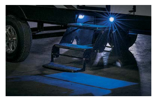
Safety step is triple step with built-in blue LED safety light.