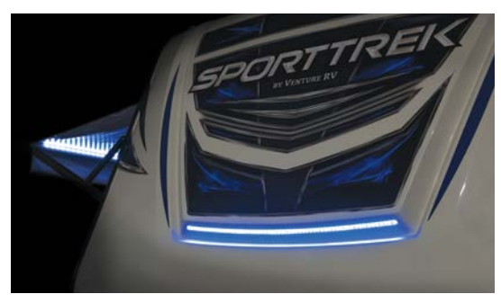
Optional 3/4 front cap with upgraded graphics.