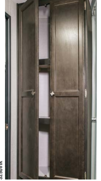
Linen closet (floorplan specific).