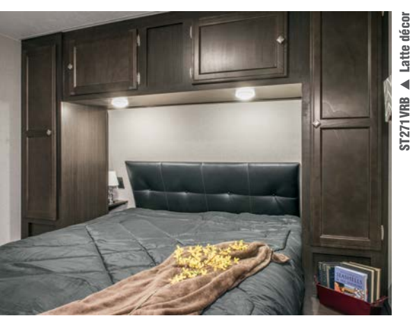
At the end of the day, the bedroom welcomes you home with a designer padded headboard, Sleep Tight® mattress, overhead storage cabinets and full-length closets for personal storage. The easy-access nightstands include a USB port for recharging mobile devices, as well as shelf with 110V outlet for CPAP machine.