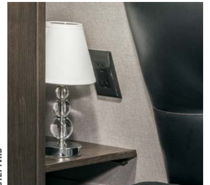
Handy shelf next to the bed provides a 110V receptacle, as well as a USB port for charging mobile devices. Most CPAP breathing machines fit.