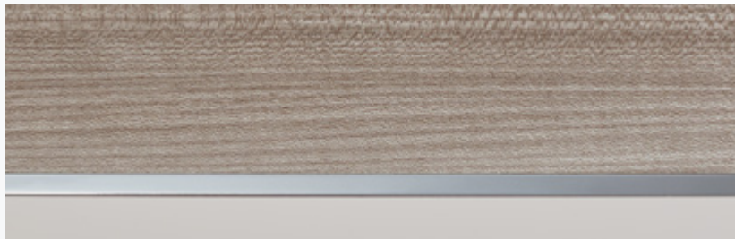
MIAMI MODERN CABINETRY