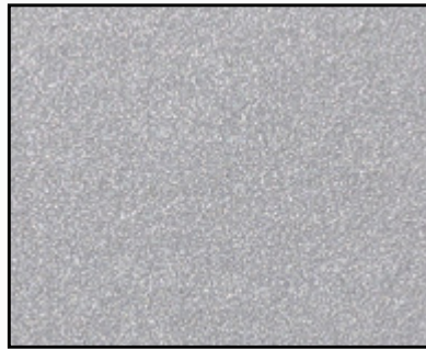
SILVER PARTIAL PAINT