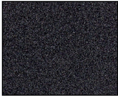
CHARCOAL PARTIAL PAINT