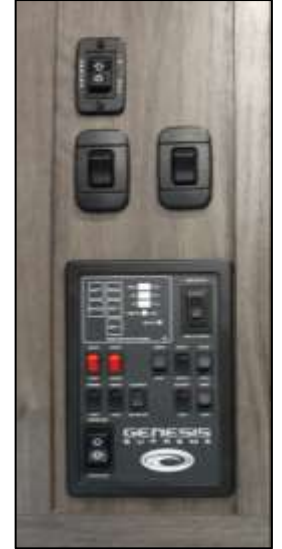
Convenient Control & Monitor Center