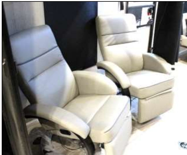
Dual Euro Swivel/Rockers