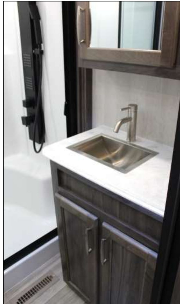
Stainless Sink/Designer Fixtures