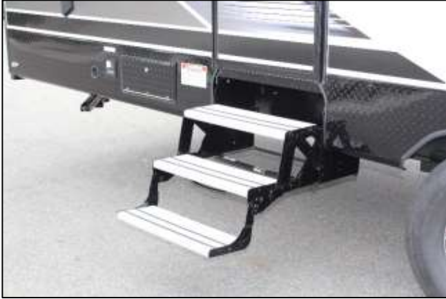
Triple Radius Entry Door Step