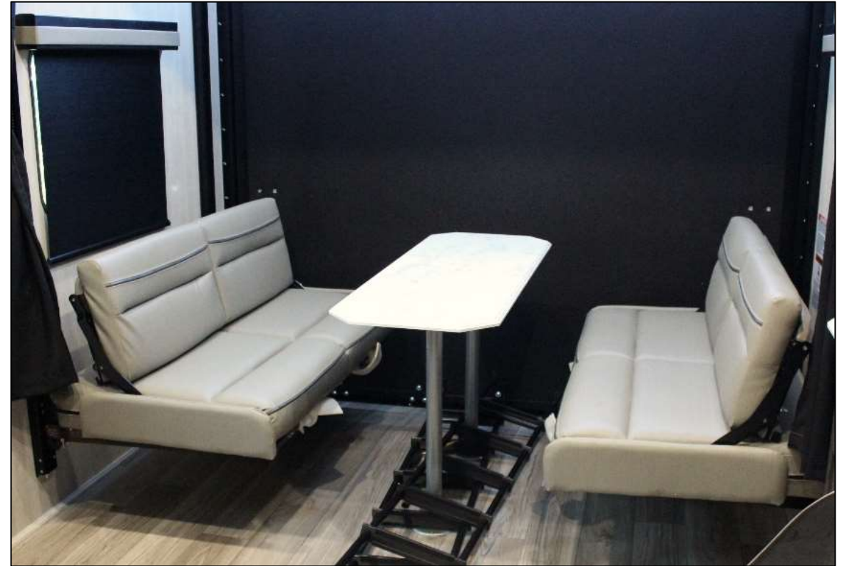
Dual Facing Dinette w/Table