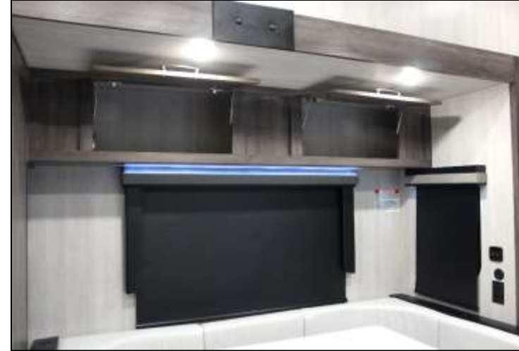
Slideout Overhead Storage