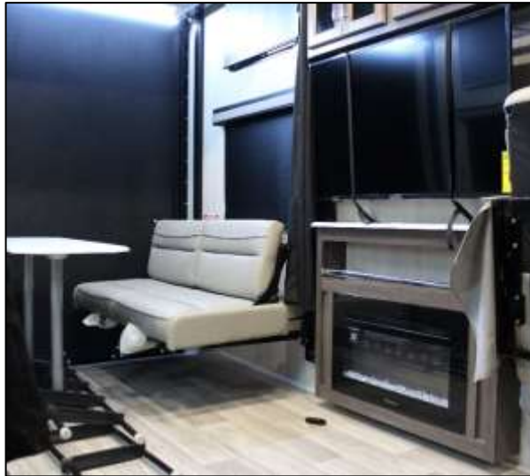
Garage Entertainment Center