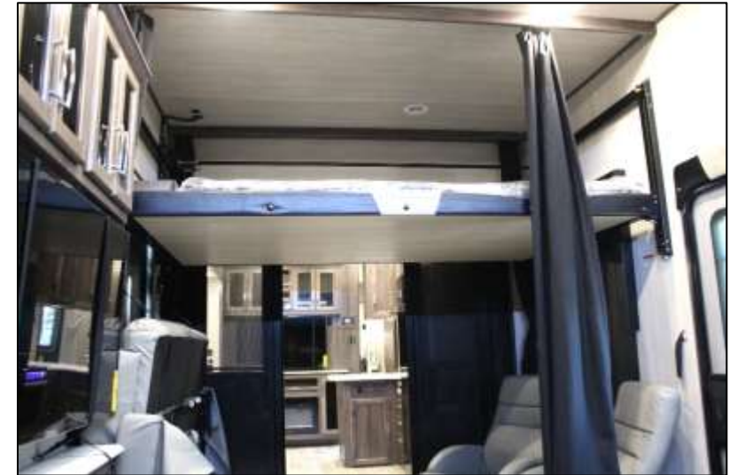
Happi-Jac w/Upper Bed