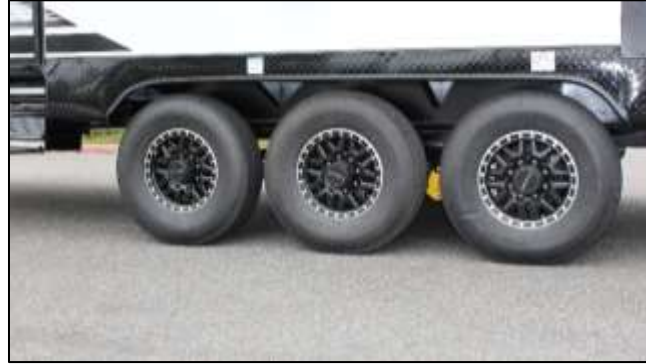
7000 Lb. Triple Axles w/16\" Wheels & LR G Tires