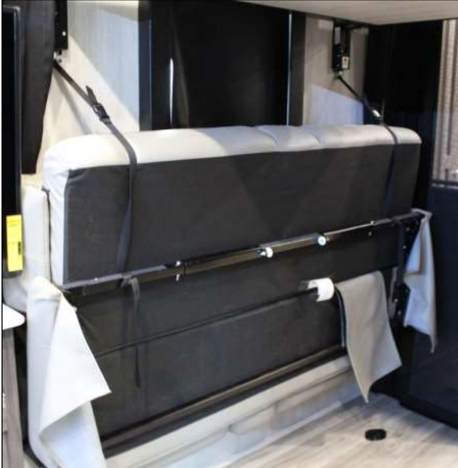
Short Leg Happi-Jac (Upper Bed Above)