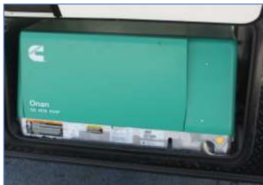
Onan 5.5KW Generator