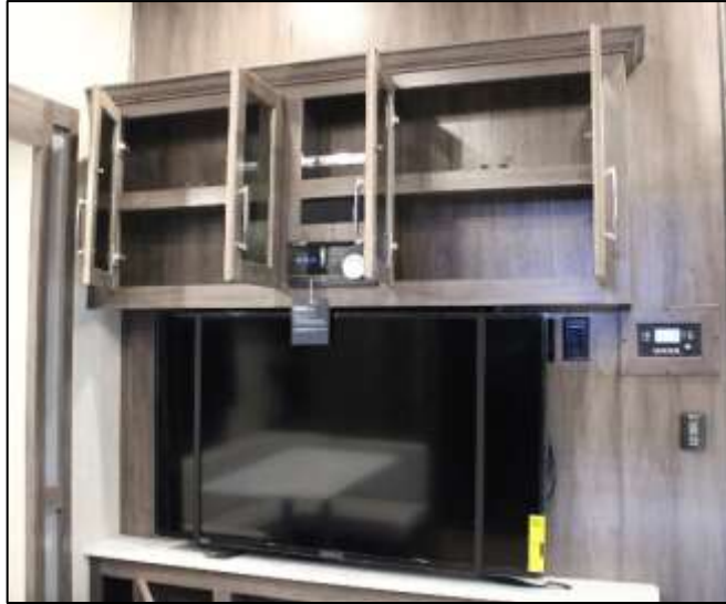
Media Storage/Control Center w/40" TV