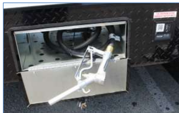
40-Gallon Fuel Station