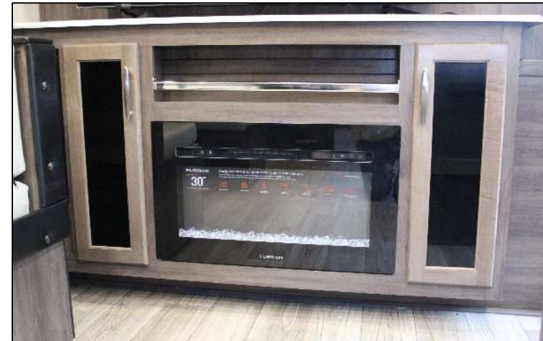
30" Living Room Electric Fireplace