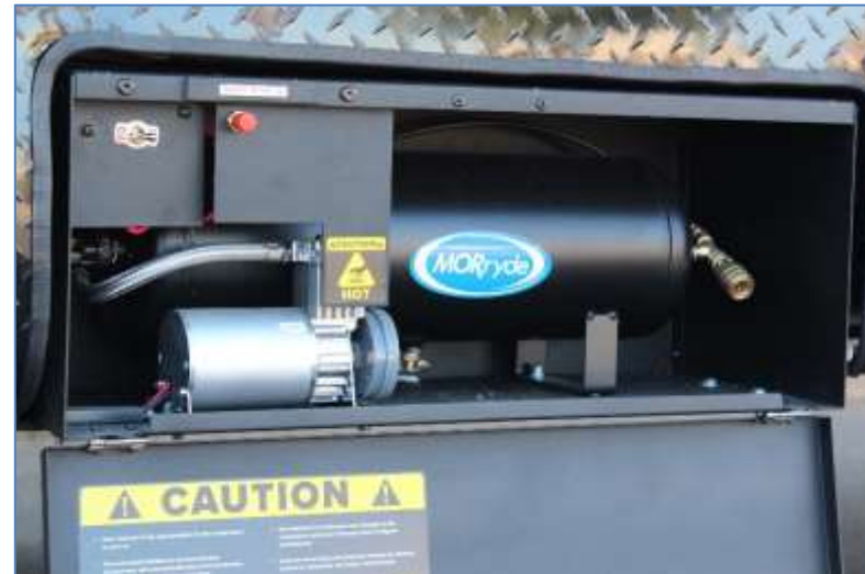
Optional On-Board Air Compressor