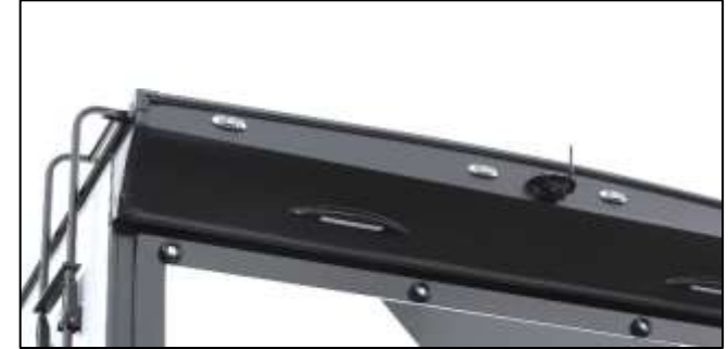
Patented Spoiler/Wireless Backup Camera