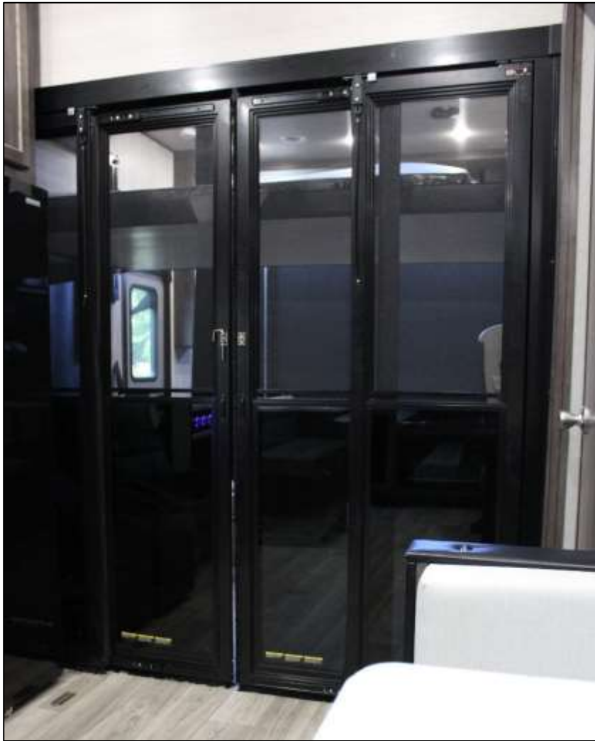
3-Season Door/Glass Panel (View from Living Room to Garage)