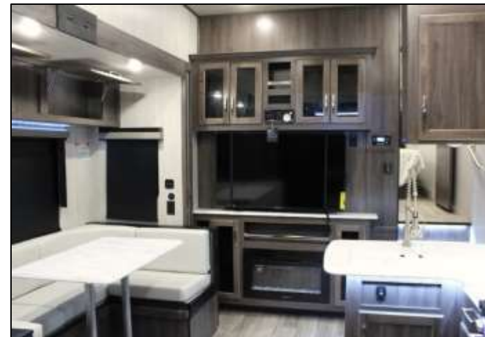
Living Room Entertainment Center