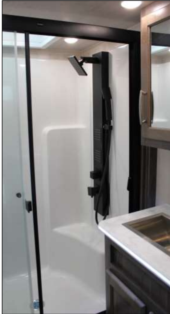
48X36 Fiberglass Shower w/Glass Door