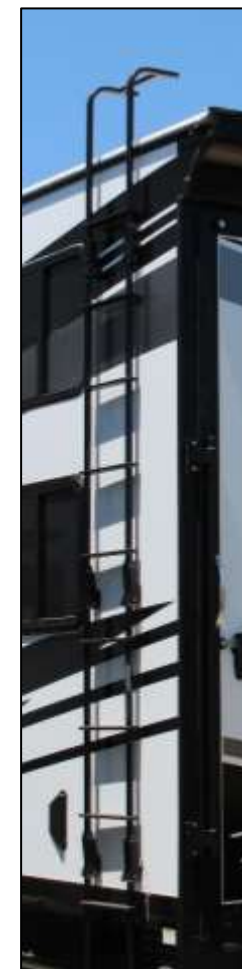
Exterior Folding Ladder & Walk-On Roof