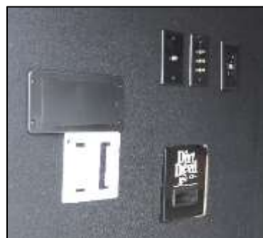
Exterior TV Hookups & Bracket