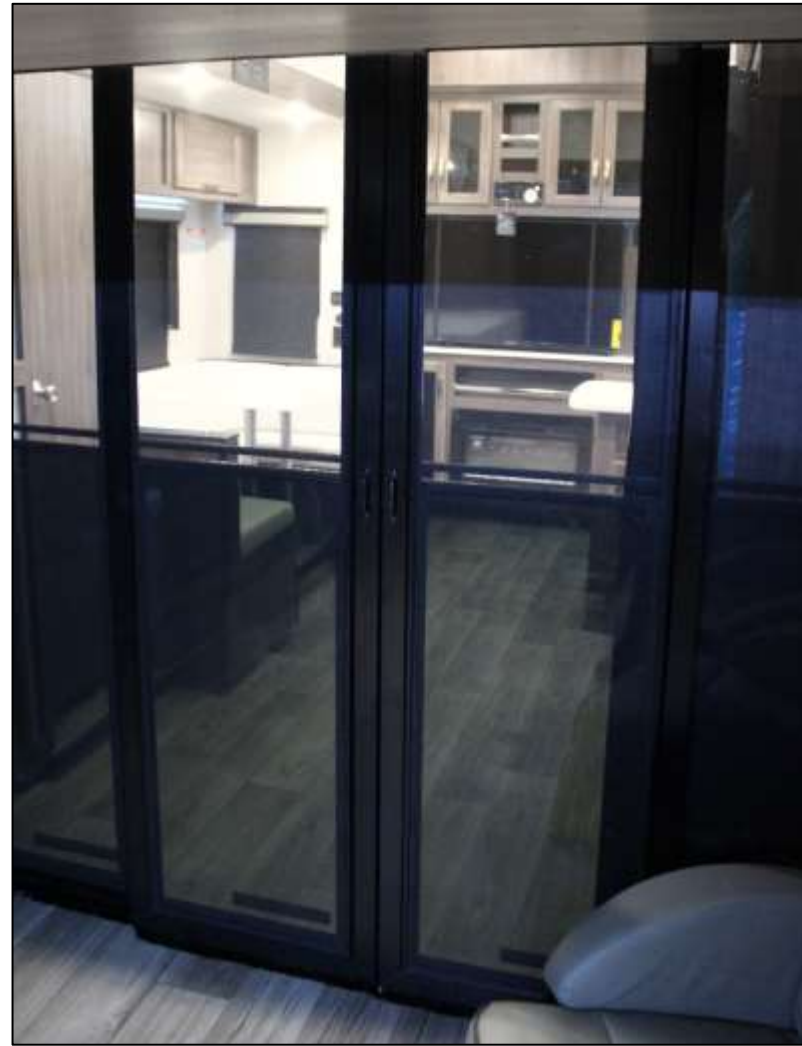
3-Season Door/Glass Panel (View from Garage to Living Room)