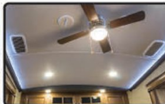
DUAL 15K QUIET COOL AIR CONDITIONING SYSTEM