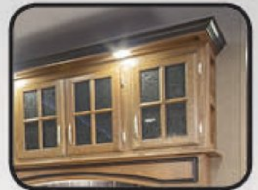
HARDWOOD CHERRY CABINET FRAMING (STILES)