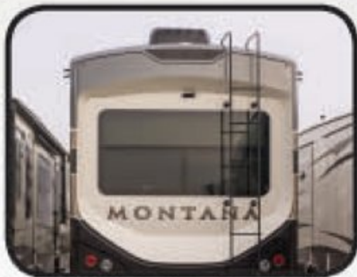
DECORATIVE FIBERGLASS REAR CAP (N/A 3790, 3791)