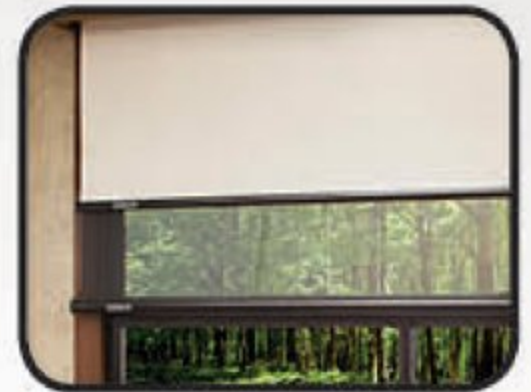
UPGRADE DAY/NIGHT ROLLER SHADES