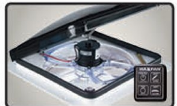
KITCHEN POWER RAIN SENSOR VENT FAN W/MULTI-SPEED WALL CONTROL