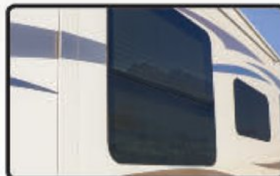
UPGRADE FRAMELESS WINDOWS