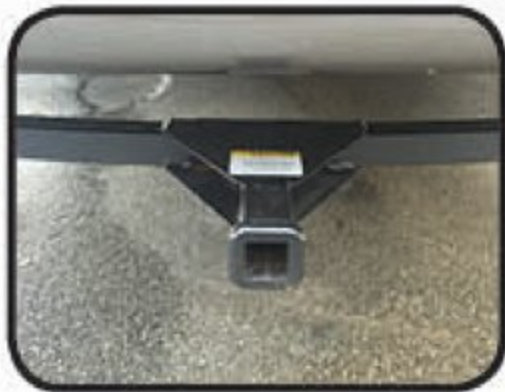
REAR ACCESSORY HITCH