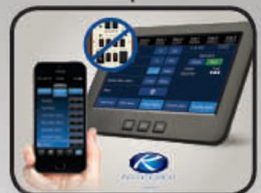
iN-COMMAND CONTROL SYSTEMS