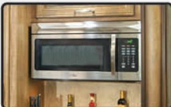
30" RESIDENTIAL CONVECTION MICROWAVE