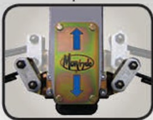
EXCLUSIVE MOR/Ryde 4100 SUSPENSION SYSTEM W/ WET BOLTS