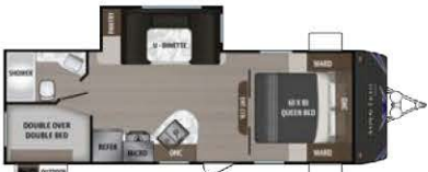
ASPEN TRAIL 2340BH's Length: 27' 8" Weight: 5,599 lbs. Sleeps: 4-6 Hitch: 619 lbs. Height: 11'2"