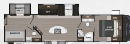
ASPEN TRAIL 3320BH's Length: 37' 11" Weight: 8,830 lbs. Sleeps: 8-10 Hitch: 1,229 lbs. Height: 11'8"