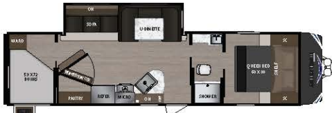
ASPEN TRAIL 3120BH's Length: 35' 1" Weight: 6,964 lbs. Sleeps: 6-8 Hitch: 880 lbs. Height: 11'3"