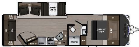
ASPEN TRAIL 2860RL's Length: 32' 6" Weight: 6,501 lbs. Sleeps: 4-6 Hitch: 738 lbs. Height: 11'3"