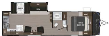
ASPEN TRAIL 2880RK's Length: 32' 11" Weight: 6,625 lbs. Sleeps: 4-6 Hitch: 679 lbs. Height: 11'2"