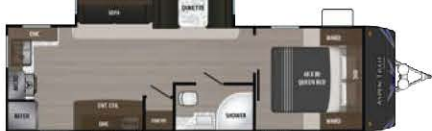
ASPEN TRAIL 2610RK's Length: 30' 3" Weight: 6,373 lbs. Sleeps: 4-6 Hitch: 801 lbs. Height: 11'5"