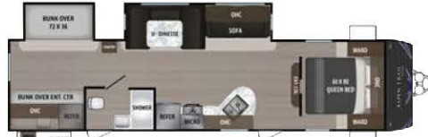
ASPEN TRAIL 3010BHDS Length: 35' 9" Weight: 7,741 lbs. Sleeps: 8-10 Hitch: 942 lbs. Height: 11'7"