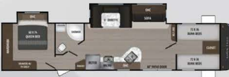
ASPEN TRAIL 3650BHDS Length: 39' 9" Weight: 8,179 lbs. Sleeps: 8-10 Hitch: 930 lbs. Height: 11'5"