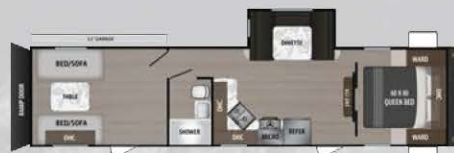
ASPEN TRAIL 3250TH's Length: 36' 9" Weight: 7,297 lbs. Sleeps: 6-8 Hitch: 1,293 lbs. Height: 11'6"

To learn more visit our website dutchmen.com