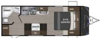
ASPEN TRAIL 1900RB Length: 24' 8" Weight: 4,173 lbs. Sleeps: 2-4 Hitch: 523 lbs. Height: 10'8"