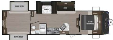
ASPEN TRAIL 3230BH's Length: 36' 3" Weight: 8,098 lbs. Sleeps: 10-12 Hitch: TBD Height: 11'3"