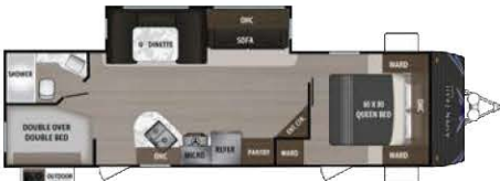
ASPEN TRAIL 2850BH's Length: 32' 9" Weight: 6,617 lbs. Sleeps: 6-8 Hitch: 729 lbs. Height: 11'3"