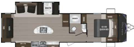
ASPEN TRAIL 3070RL's Length: 34' 11" Weight: 7,333 lbs. Sleeps: 4-6 Hitch: 975 lbs. Height: 11'2"