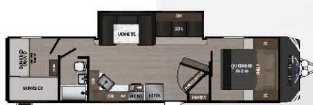
ASPEN TRAIL 3280BH's Length: 36' 3" Weight: 7,190 lbs. Sleeps: 8-10 Hitch: 1,110 lbs. Height: 11'6"