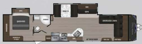
ASPEN TRAIL 3680FLDS Length: 39' 9" Weight: 8,130 lbs. Sleeps: 6-8 Hitch: 889 lbs. Height: 11'5"

*Note: If the model has a "1" at the end this signifies it has a 12 Volt Refrigerator.