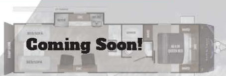
ASPEN TRAIL 2950TH's Length: TBD Weight: TBD Sleeps: 4-6