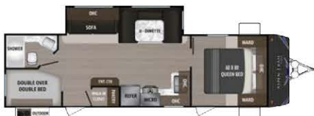
ASPEN TRAIL 2790BH's Length: 31' 11" Weight: 6,577 lbs. Sleeps: 6-8 Hitch: 639 lbs. Height: 11'3"