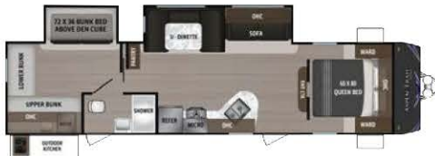
ASPEN TRAIL 3210BHDS Length: 36' 10" Weight: 7,720 lbs. Sleeps: 8-10 Hitch: 1,074 lbs. Height: 11'4"