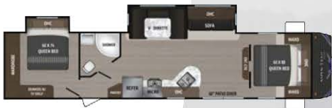
ASPEN TRAIL 3600QBDS Length: 39' 9" Weight: 8,184 lbs. Sleeps: 6-8 Hitch: 1,091 lbs. Height: 11'5"