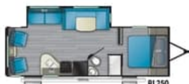
RL250 Length: 30' 6" Dry: 6,134 lbs. Hitch: 620 lbs. Height: 11' 2" GVWR: 7,600 lbs.