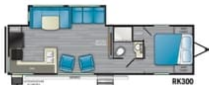
RK300 Length: 34' 5" Dry: 6,912 lbs. Hitch: 728 lbs. Height: 11' 2" GVWR: 9,000 lbs.