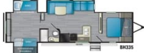
BH335 Length: TBD Dry: TBD Hitch: TBD Height: TBD GVWR: TBD