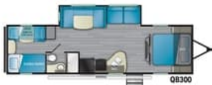
QB300 Length: 35' 0" Dry: 6,896 lbs. Hitch: 806 lbs. Height: 11' 2" GVWR: 9,000 lbs.