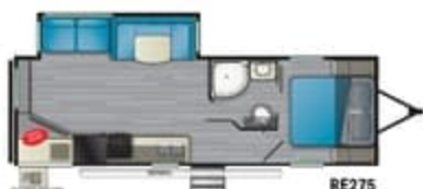
RE275 Length: 32' 6" Dry: 6,416 lbs. Hitch: 670 lbs. Height: 11' 2" GVWR: 7,700 lbs.