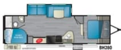
BH280 Length: 34' 6" Dry: 6,810 lbs. Hitch: 654 lbs. Height: 11' 2" GVWR: 9,000 lbs.