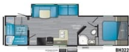
BH322 Length: 36' 11" Dry: 7,436 lbs. Hitch: 788 lbs. Height: 11' 4" GVWR: 9,000 lbs.