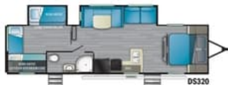
DS320 Length: 37' 5" Dry: 7,696 lbs. Hitch: 870 lbs. Height: 11' 4" GVWR: 9,000 lbs.