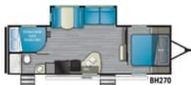
BH270 Length: 32' 7" Dry: 6,354 lbs. Hitch: 680 lbs. Height: 11' 2" GVWR: 7,700 lbs.