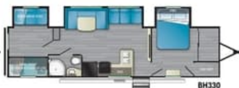
BH330 Length: 37' 7" Dry: 8,926 lbs. Hitch: 794 lbs. Height: 11' 4" GVWR: 10,400 lbs.