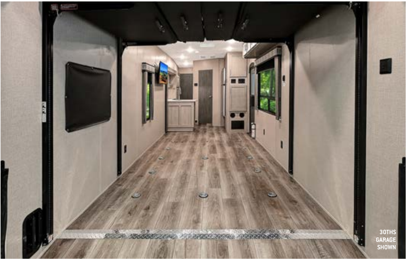
30THS GARAGE SHOWN

Affordable toy haulers are not just a dream anymore! Our Trail Blazer 28THS and 30THS layouts offer large open garages for total versatility in what you want to haul, a highlight to the 16' of clear space in the award winning 30THS. Higher ceilings, standard Happijac bed systems, a 98 gal. fresh water tank, and optional 30 gal. on-board fuel station really makes for the ultimate experience anywhere your travels take you.