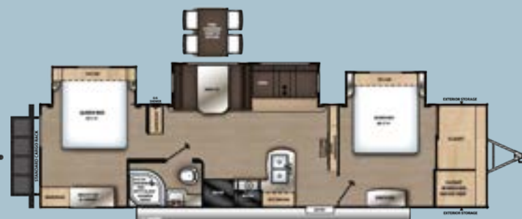
343BHTS (2 QUEEN)