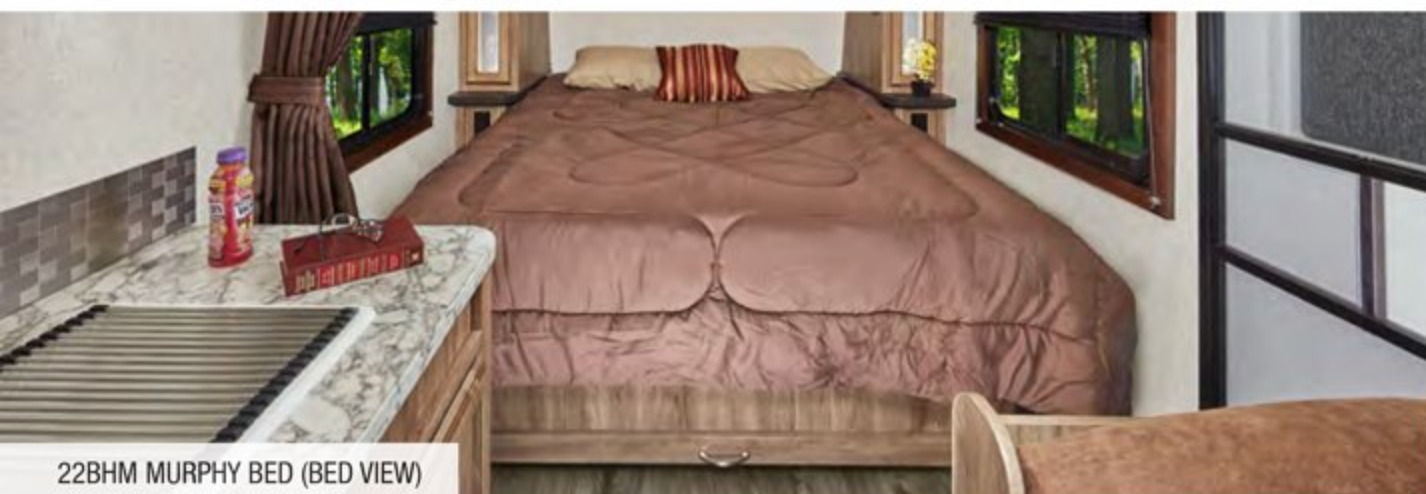
22BHM MURPHY BED (BED VIEW)