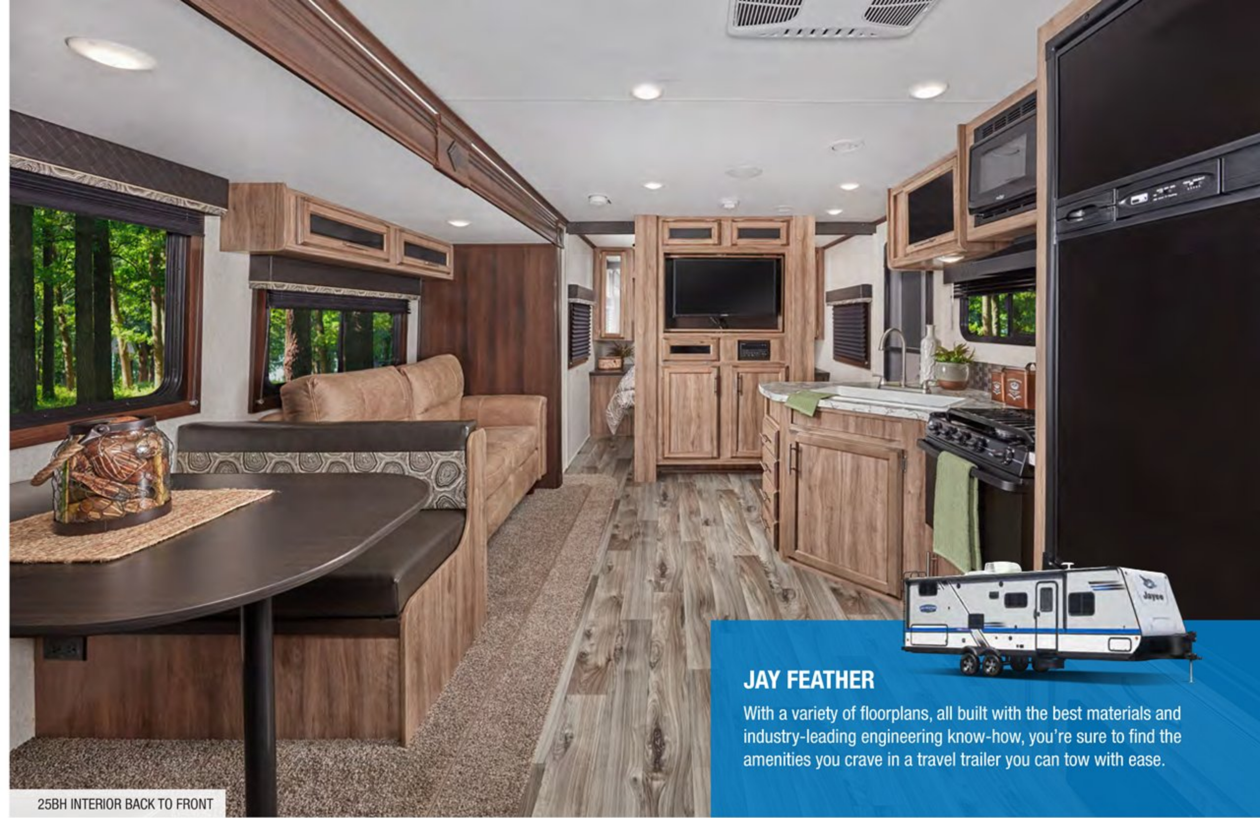
25BH INTERIOR BACK TO FRONT