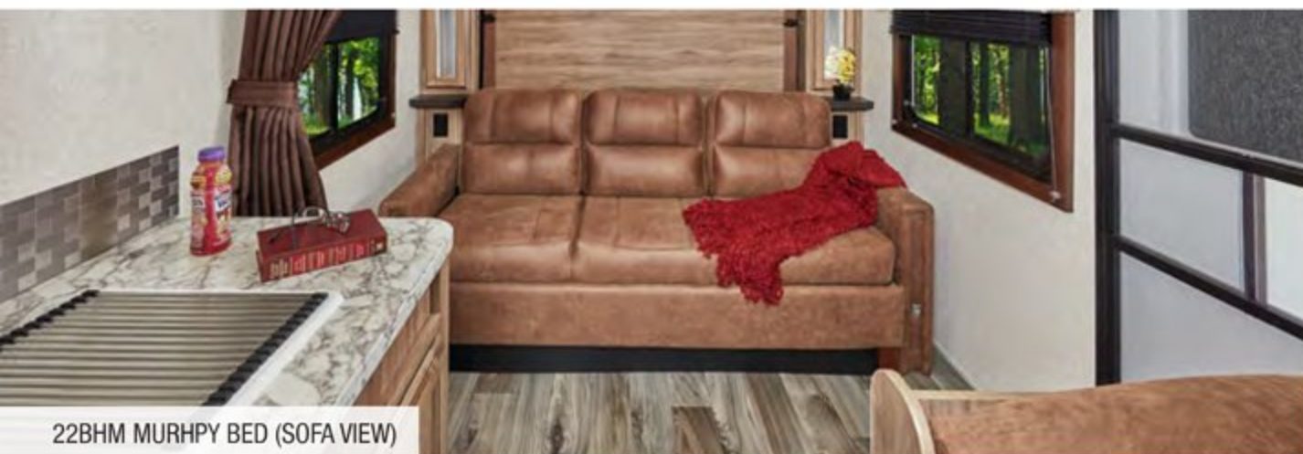
22BHM MURPHY BED (SOFA VIEW)