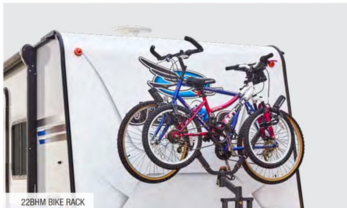
22BHM BIKE RACK