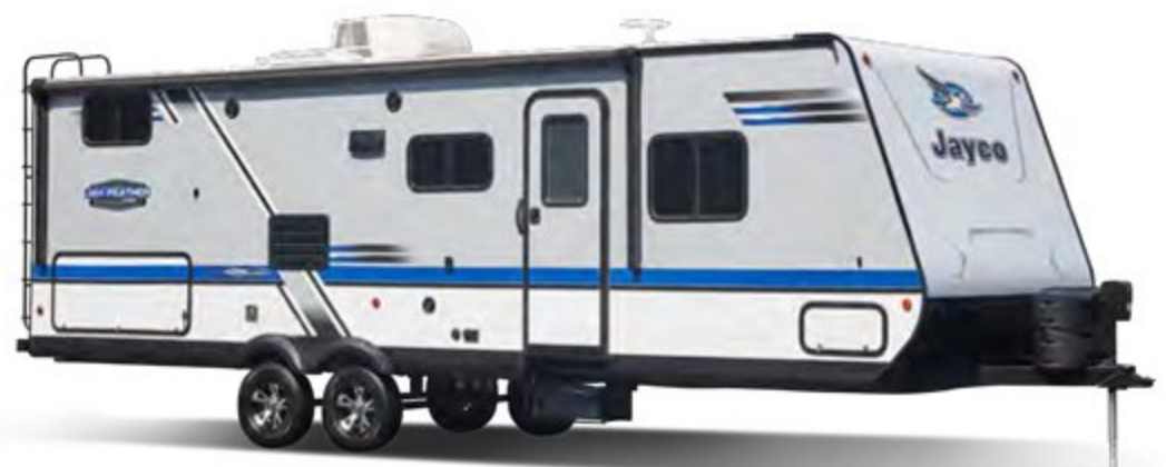
Jay Feather: Page 5