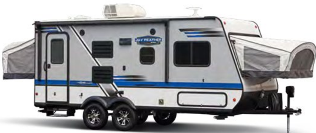
Jay Feather 7: Page 4