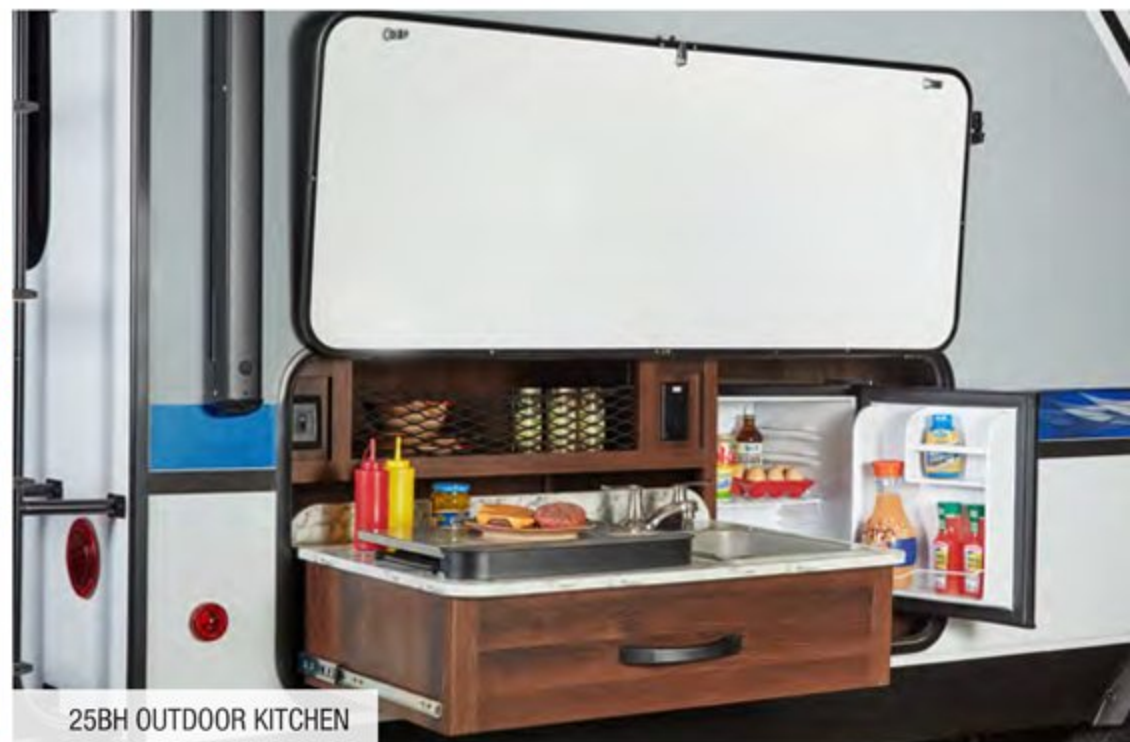
25BH OUTDOOR KITCHEN