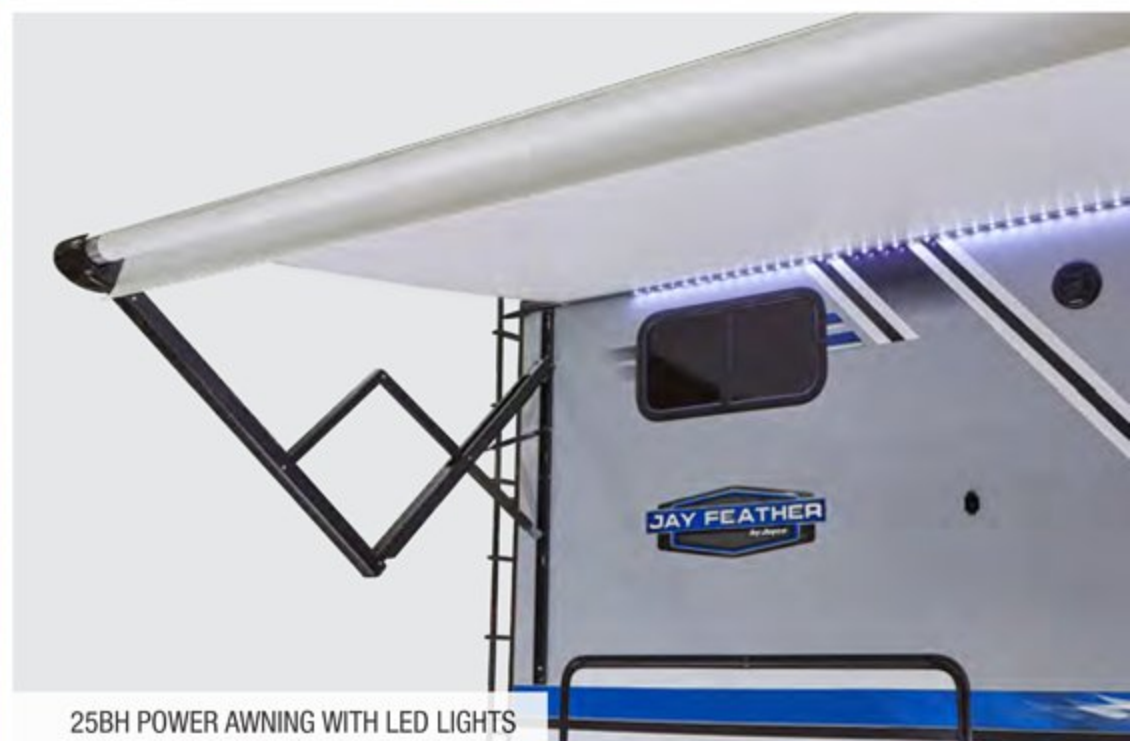
25BH POWER AWNING WITH LED LIGHTS