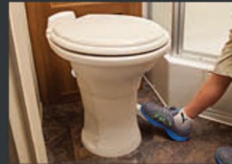
PORCELAIN FOOT FLUSH TOILET