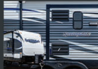
FULL BODY GRAPHICS