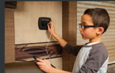
DIGITAL CHARGING STATION