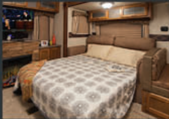
TRI-FOLD SLEEPER SOFA