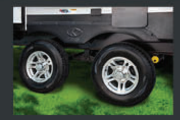
WIDE STANCE AXLES