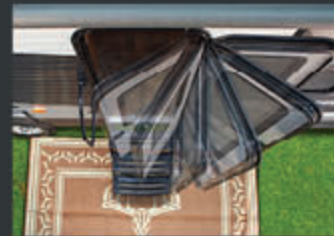
FRICTION HINGE DOOR