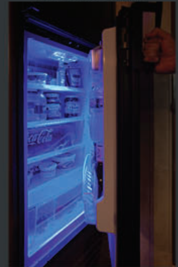
UPGRADED 7 CU. FT. REFER W/LED LIGHT