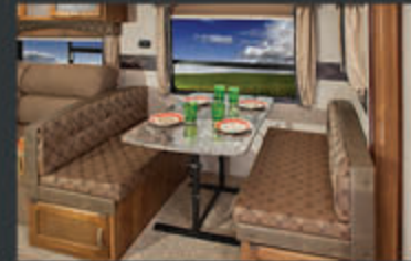
"DO-MORE" DINETTE TABLE