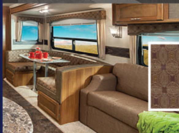
SEA MIST DECOR