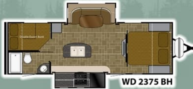
WD 2375 BH