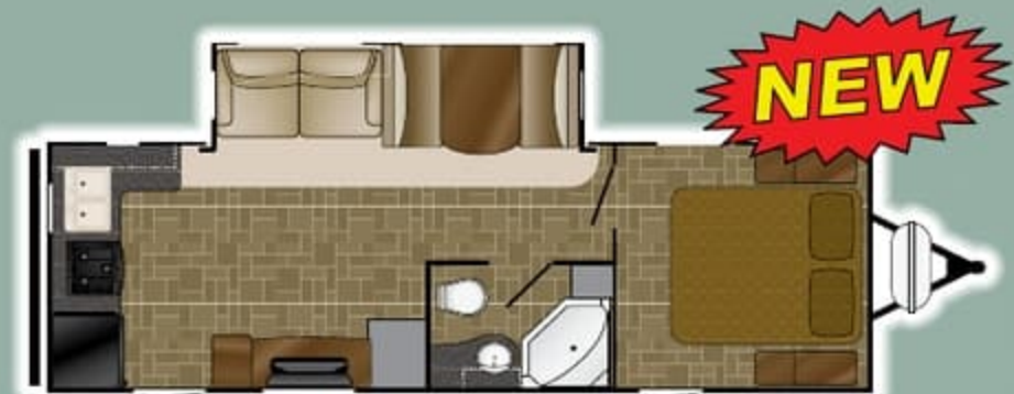
WD 2575 RK