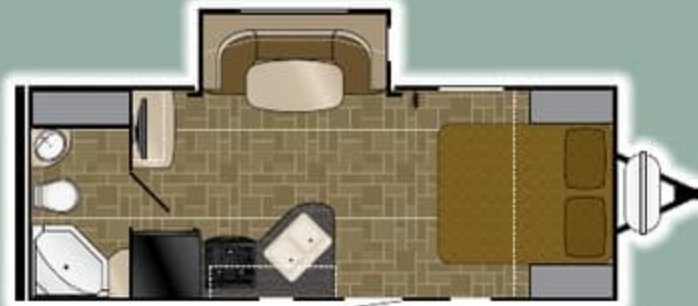
WD 2175 RB