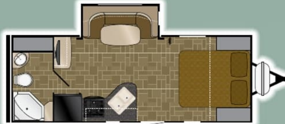
WD 2175 RB