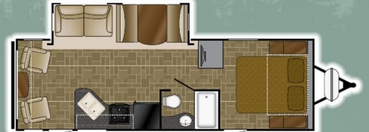
WD 2750 RL