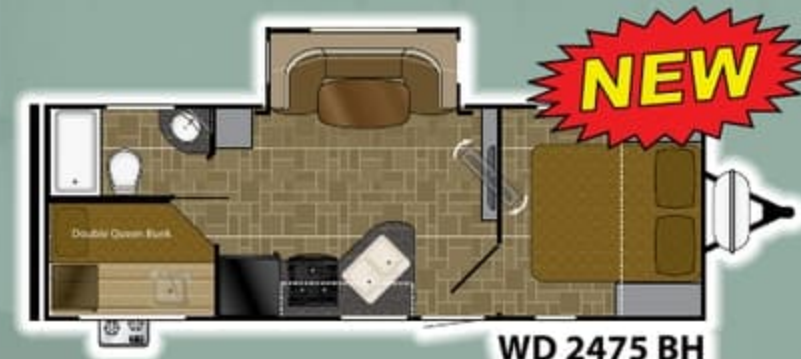
WD 2475 BH