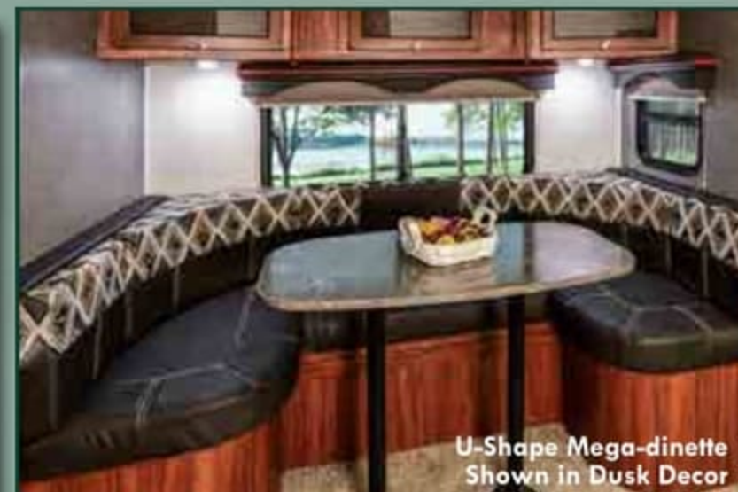
U-Shape Mega-dinette Shown in Dusk Decor