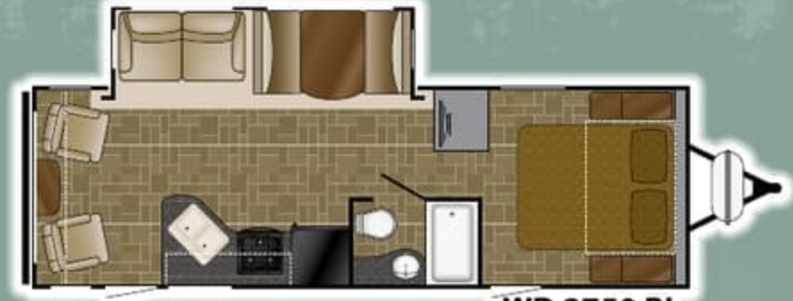
WD 2750 RL