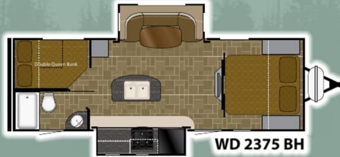
WD 2375 BH