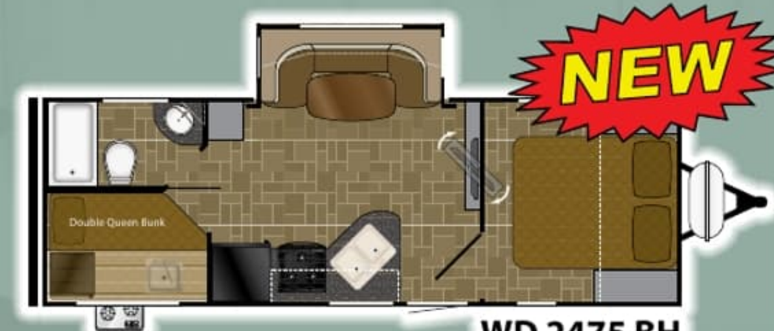
WD 2475 BH