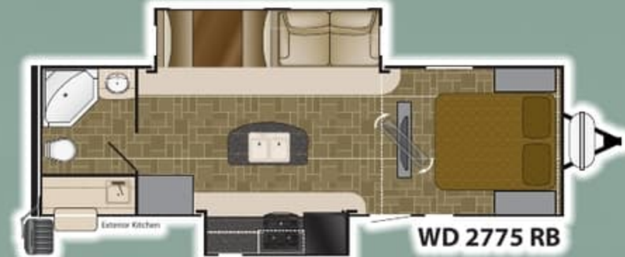
WD 2775 RB