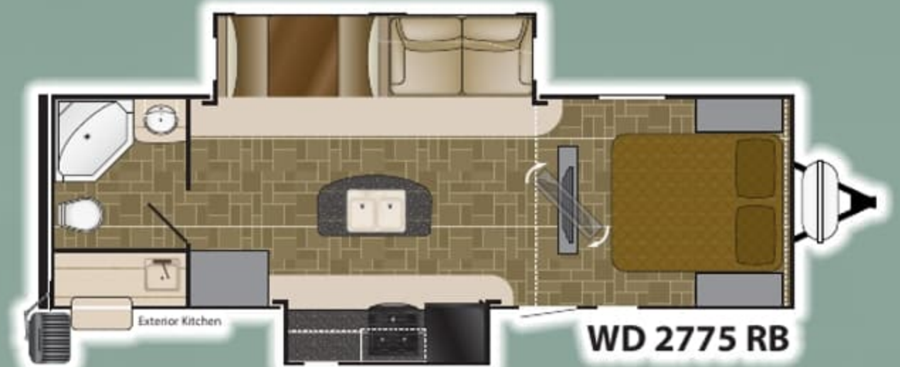
WD 2775 RB