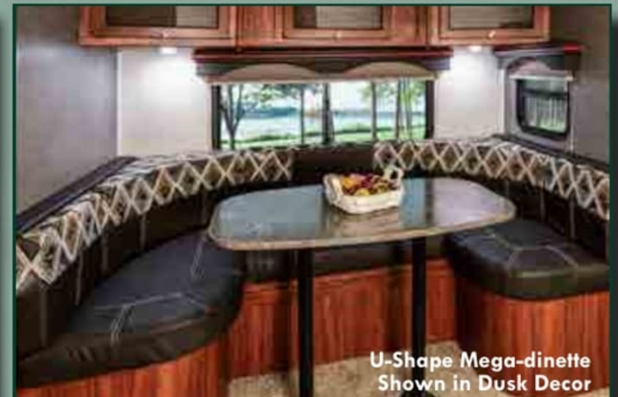
U-Shape Mega-dinette Shown in Dusk Decor