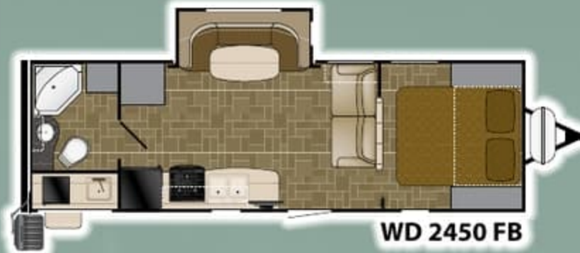
WD 2450 FB