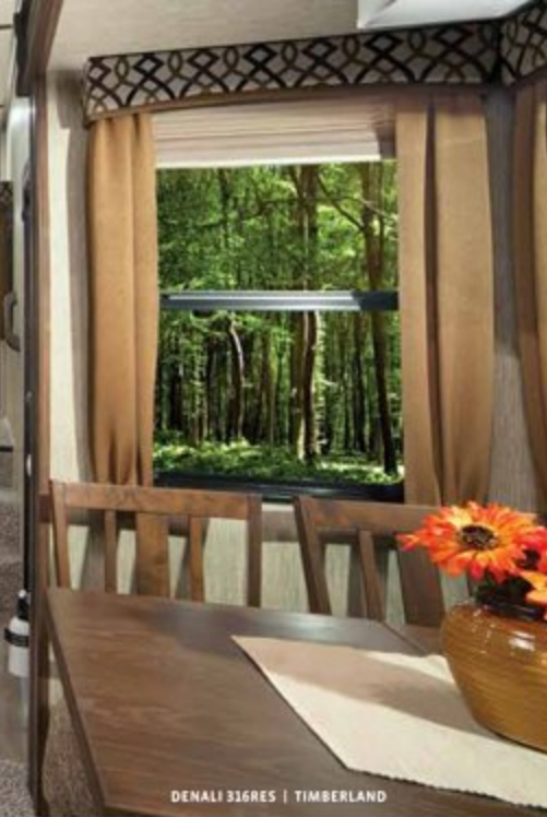
DENALI 316RES | TIMBERLAND