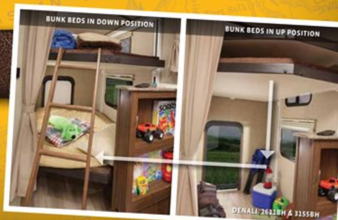
DENALI 2611BH & 3155BH

Our multi-purpose sleeping room has two retractable—height-adjustable bunks, a play space and extra storage.