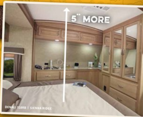
DENALI 318RB | SIENNA RIDGE

With a flush-floor master bedroom and an extra five inches of height, Denali adds more comfort to your fifth wheel space than ever before.