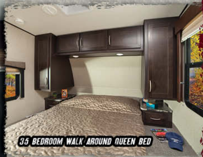
35 BEDROOM WALK AROUND QUEEN BED