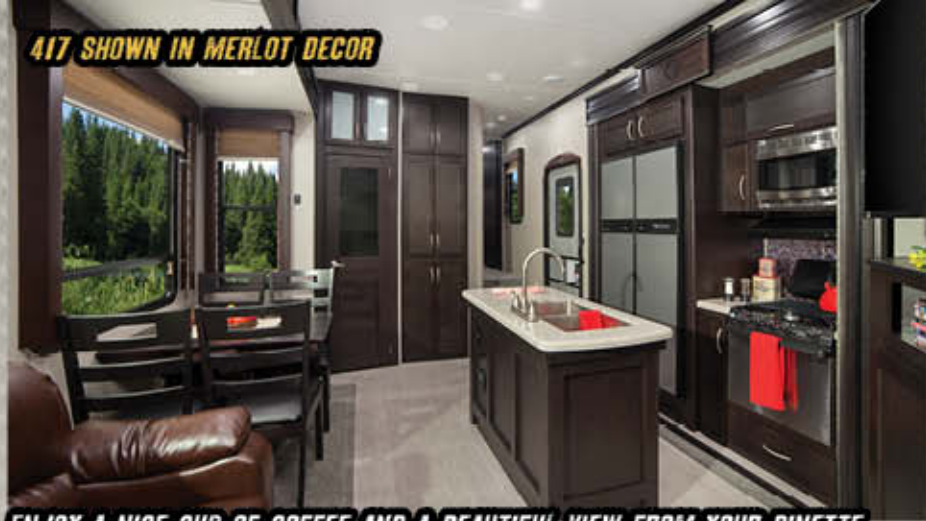
417 SHOWN IN MERLOT DECOR

ENJOY A NICE CUP OF COFFEE AND A BEAUTIFUL VIEW FROM YOUR DINETTE.