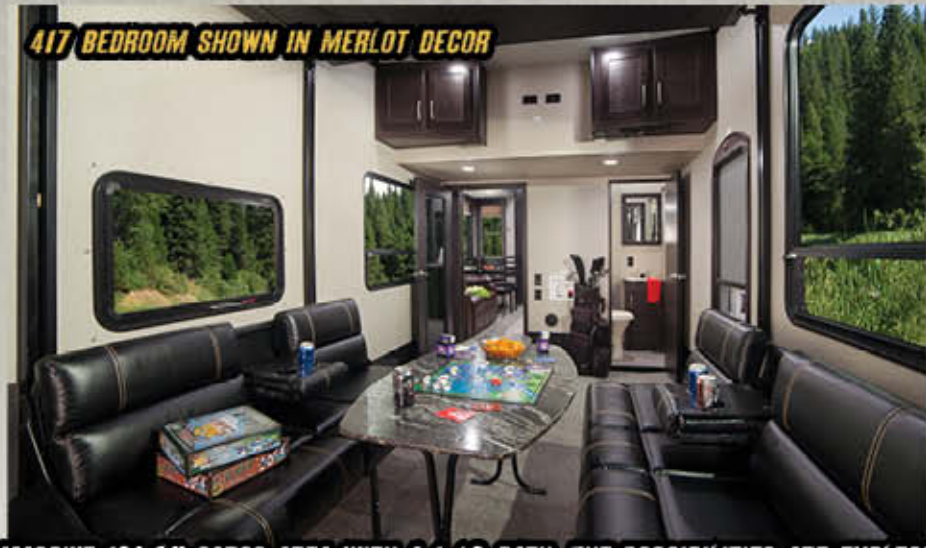
417 BEDROOM SHOWN IN MERLOT DECOR

ENJOY A NICE CUP OF COFFEE AND A BEAUTIFUL VIEW FROM YOUR DINETTE.