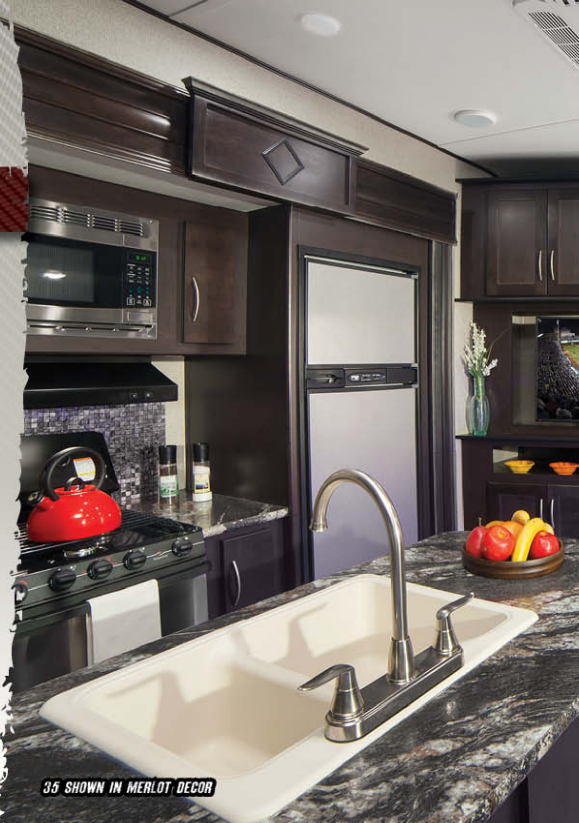
35 SHOWN IN MERLOT DECOR