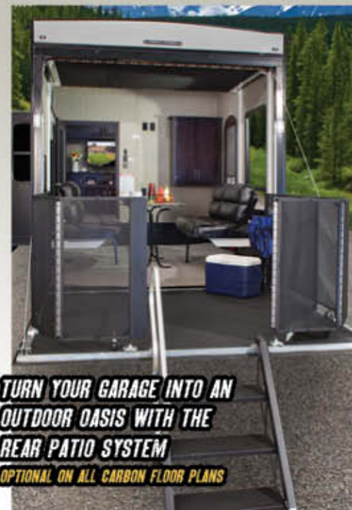
TURN YOUR GARAGE INTO AN OUTDOOR OASIS WITH THE REAR PATIO SYSTEM OPTIONAL ON ALL CARBON FLOOR PLANS

CARBON WWW.KEYSTONERV.COM/CARBON TOY HAULERS