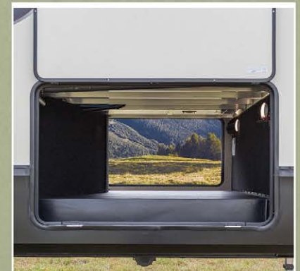
UNOBSTRUCTED PASS THRU STORAGE Clean storage area with slam latch baggage doors and magnetic catches.