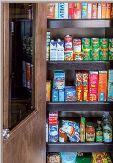
Class leading pantry storage