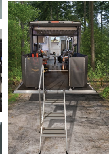
Ramp Door Party Patio Kit Option