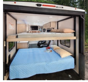
Electric Bed and Lift System Option (Standard 27KB, 29SS)