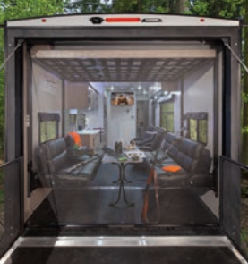
Rear Pull Down Screen