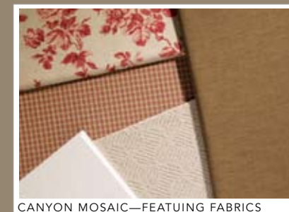
CANYON MOSAIC—FEATURING FABRICS BY LIZ CLAIBORNE