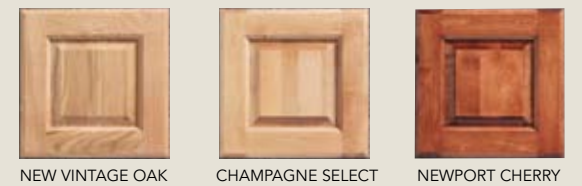
NEW VINTAGE OAK CHAMPAGNE SELECT NEWPORT CHERRY