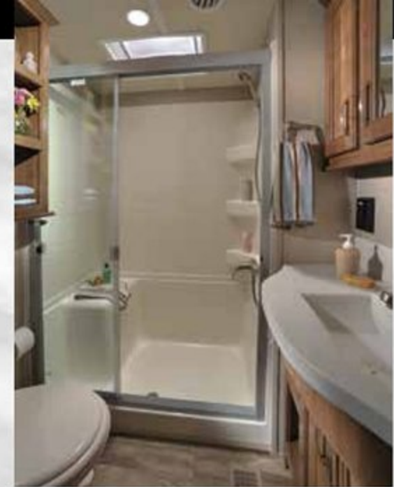
Silverback's luxurious bath includes a large 48" shower with seat and glass doors, porcelain toilet, and a Create-a-Breeze fan.