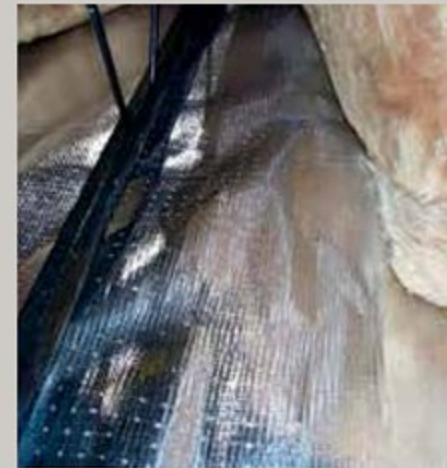
R-38 Radiant shield Therma-foil wrap through ceilings, underbellies and under front cap.