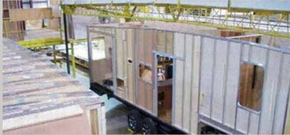
Aluminum studded sidewalls and roof trusses on 16" centers or less.