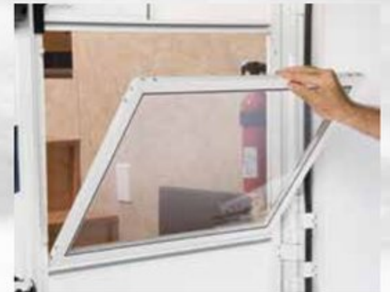
Removable "Soft Top" vinyl storm doors allow light and visibility without losing cooling or heating.