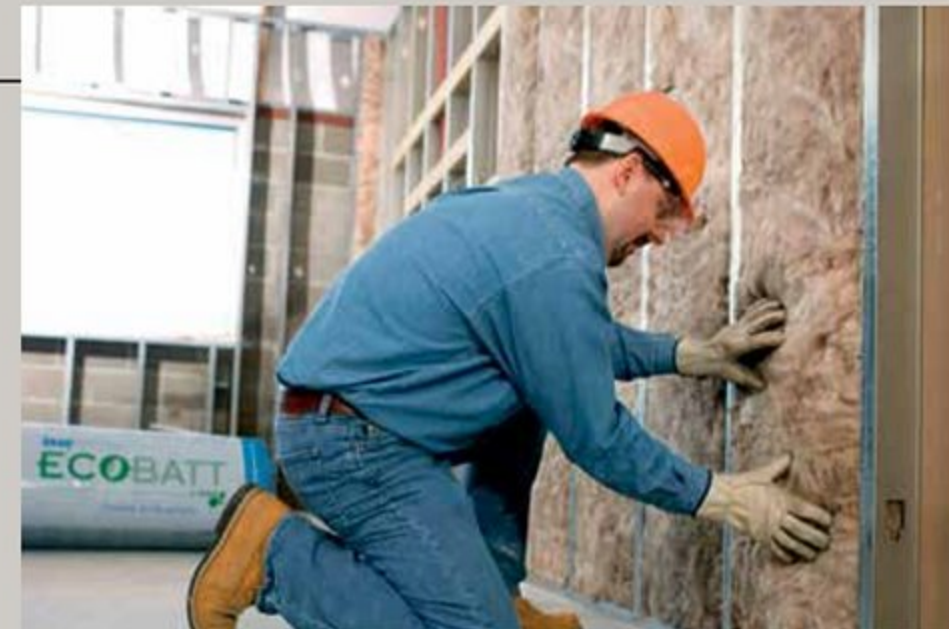
Residential, glasswool insulation designed by nature.