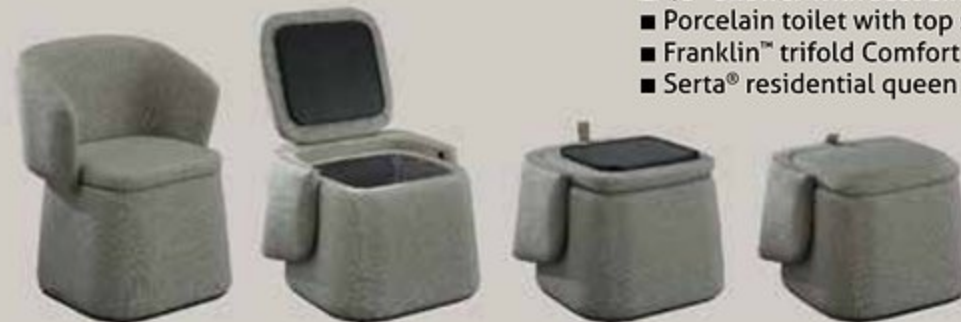
OPTIONAL MULTI-FUNCTION CHOTTOMAN

Is it an ottoman or a chair? You decide.