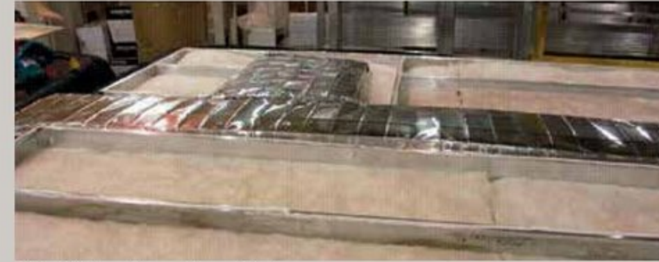
2" x 3" Aluminum floor studs