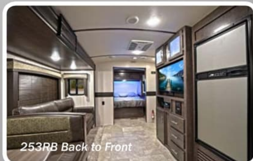
253RB Back to Front