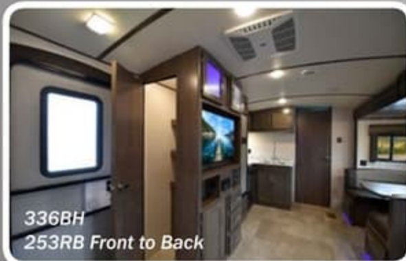
336BH 253RB Front to Back