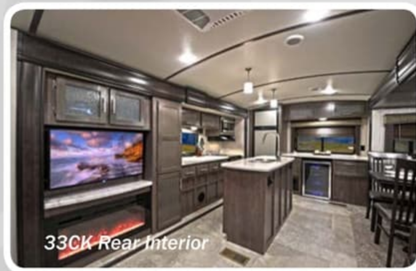
33CK Rear Interior