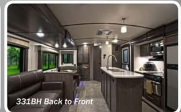
331BH Back to Front