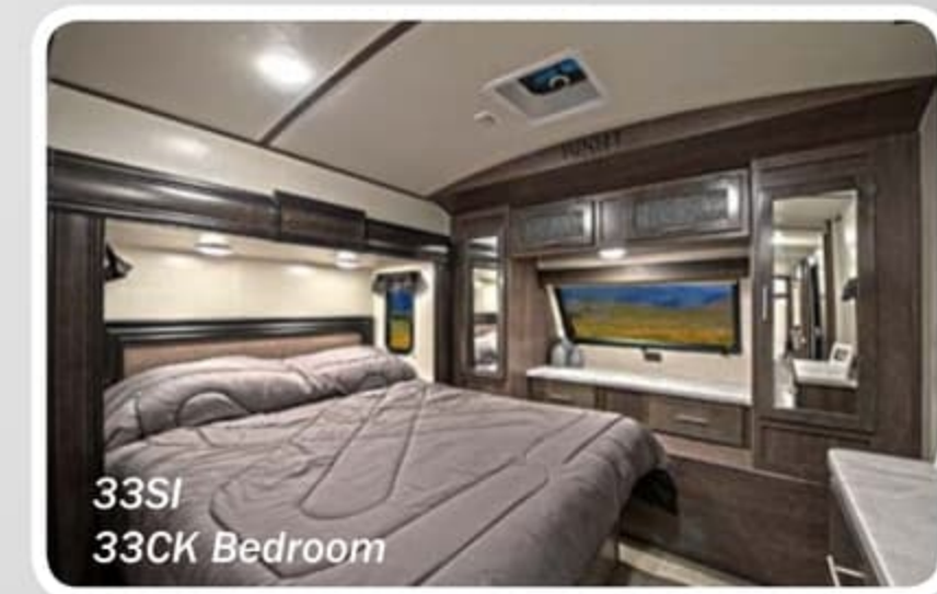
33SI 33CK Bedroom