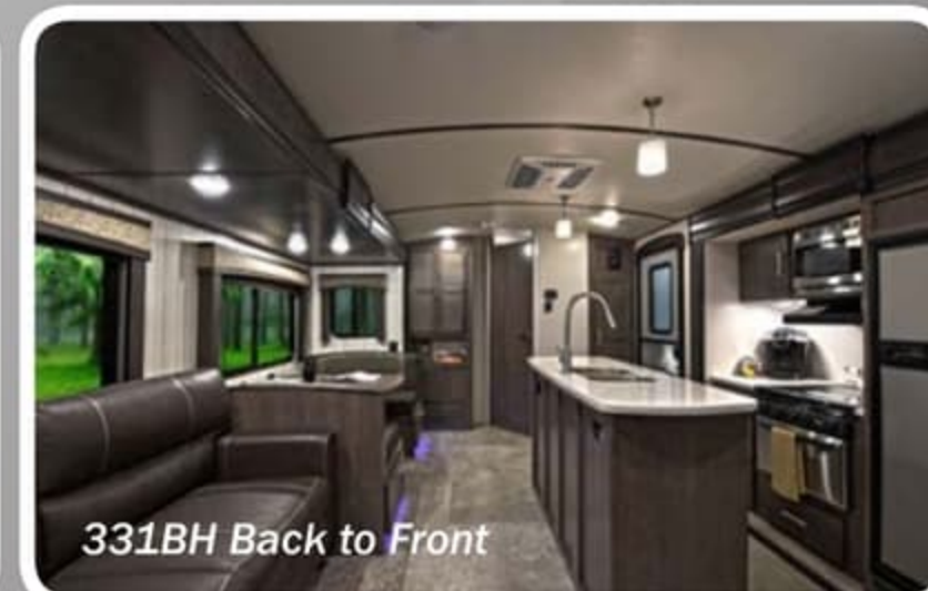
331BH Back to Front