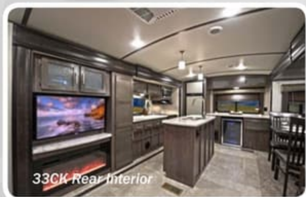
33CK Rear Interior