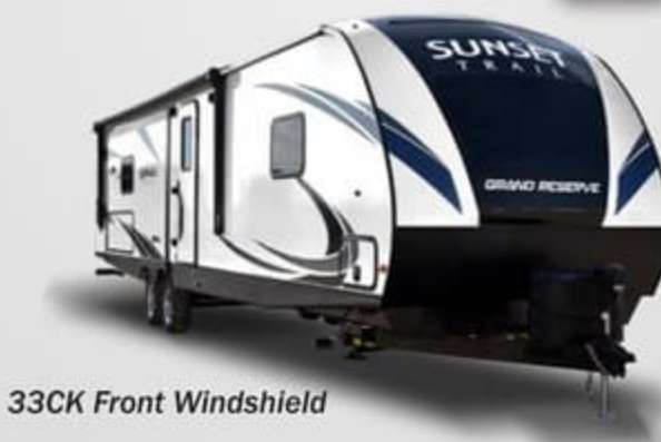
33CK Front Windshield