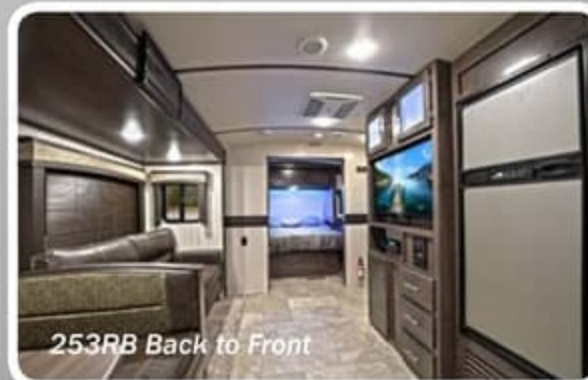
253RB Back to Front