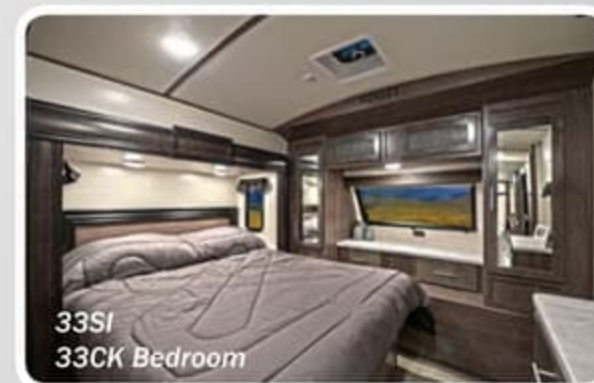
33SI 33CK Bedroom