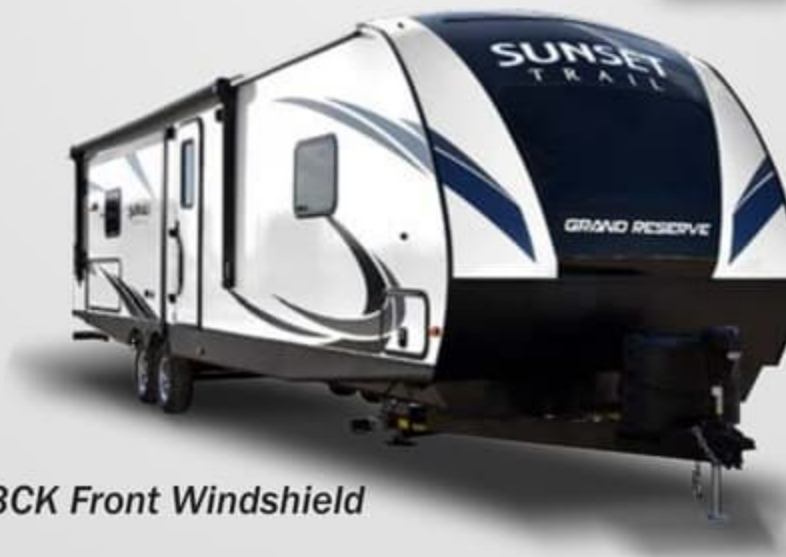
33CK Front Windshield