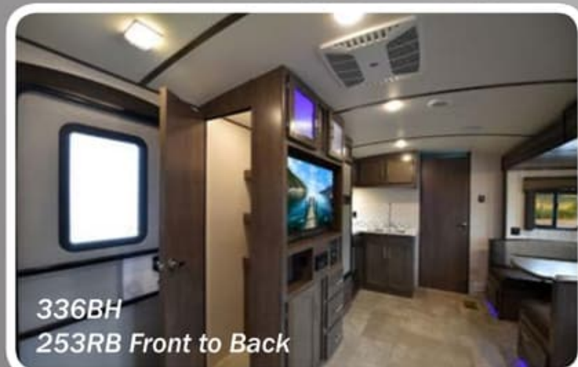
336BH 253RB Front to Back