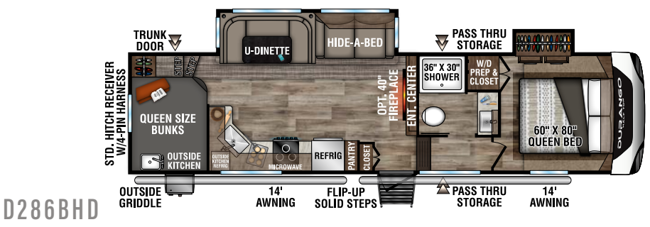
UVW - 8,540 | Exterior Length - 33'7" | Sleeps 10