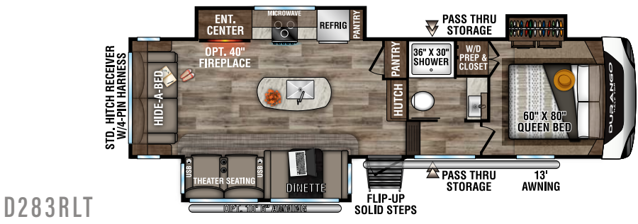
UVW - 8,700 | Exterior Length - 32' 11" | Sleeps 6