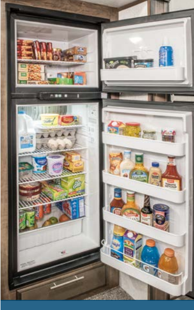
Double door gas/electric 8 CU FT REFRIGERATOR with temperature controls