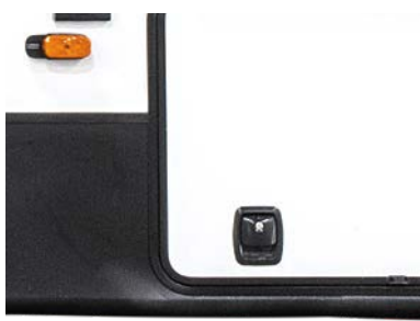
METAL SLAM LATCHES on baggage doors are easy to use and keep things safe.