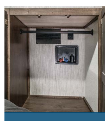
WASHER/DRYER PREP in bedroom is a higher-end feature not normally found in half-ton 5th wheel price points.