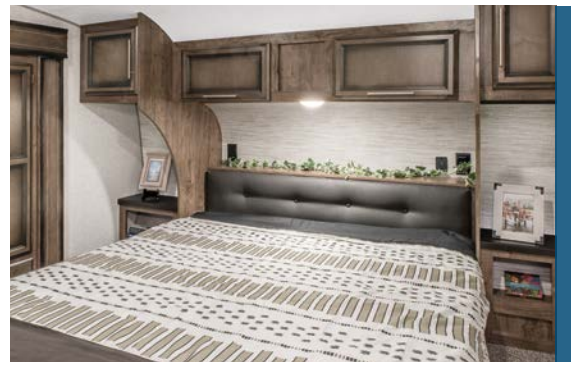
REDESIGNED FRONT BEDROOM setup.