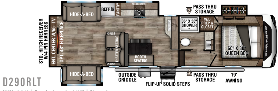
UVW - 8,940 | Exterior Length - 34' 5" | Sleeps 6