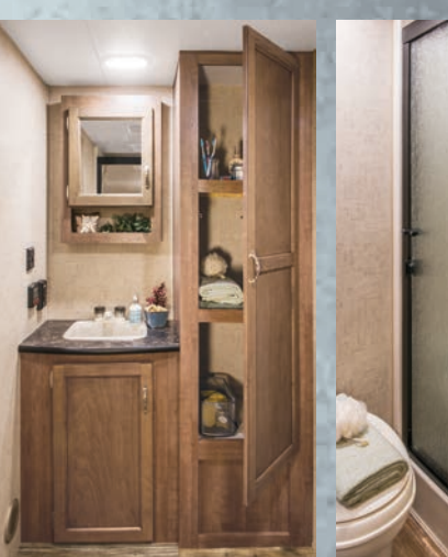
Baths offer a 48-inch residential shower with seat and plenty of storage.