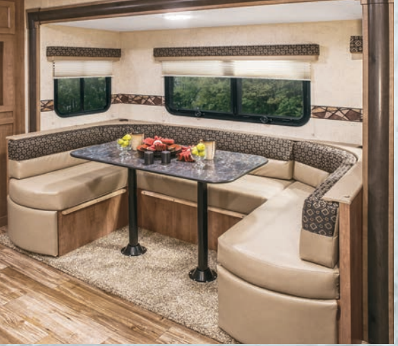
All MXTs offer large, comfortable dining areas, and most convert to additional sleeping spaces.