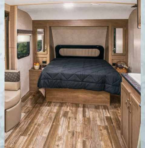
Designer headboard and under-bed storage. Sleeping areas offer bi-fold privacy doors.