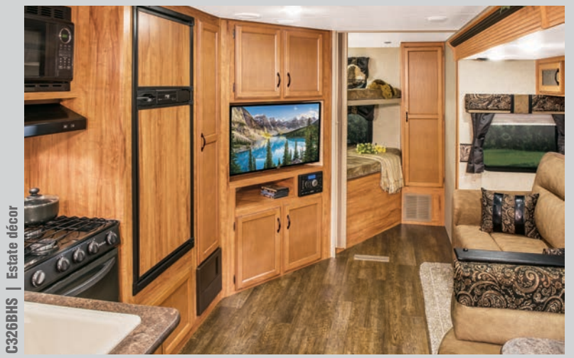
The 326BHS includes well-designed living spaces, including a huge TV and bunks for the kids.