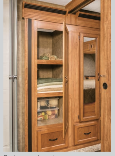
Bedrooms boast generous wardrobes.