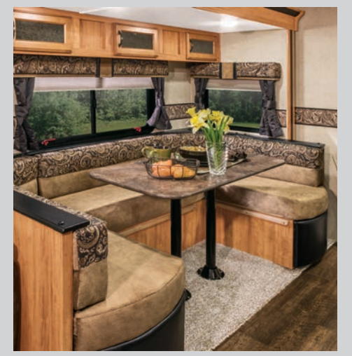
U-shaped dinettes expand seating and sleeping choices, and large slide windows offer good cross-ventilation.