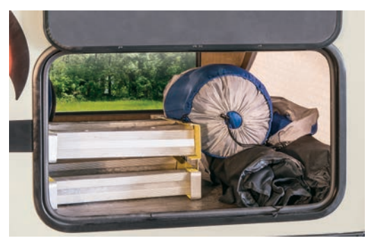
Oversized radius-cornered baggage doors with convenient magnetic catches.