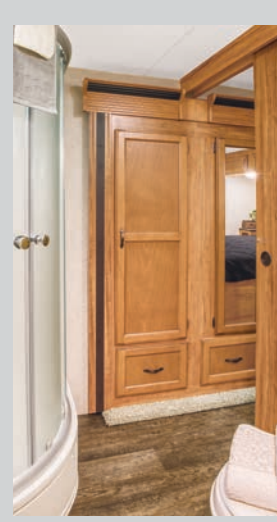
The 326BHS includes a roomy radius shower and convenient closet slideout.