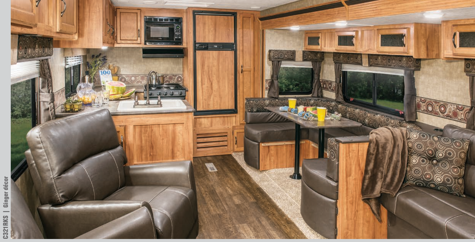
Connect offers gourmet kitchen layouts and flexible sleeping options without giving up living space.