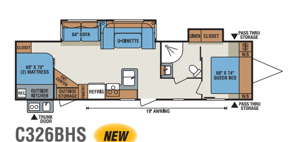
All these great Spree Connect floorplans to choose from ...!