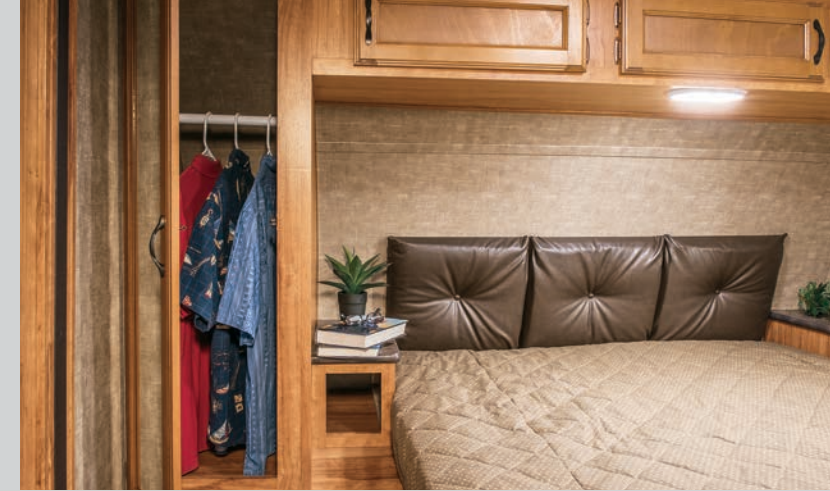
Spree is packed with storage areas, including under-bed, wardrobe and overhead cabinets.