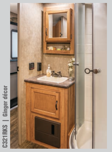
Bath areas provide all the comforts of home.