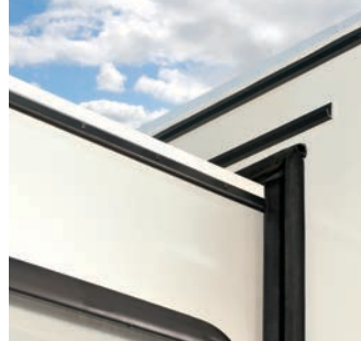
Expertly engineered multi-seal slide system offers peace of mind.