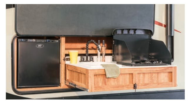
Floorplans with exterior kitchens offers the home chef virtually unlimited outdoor gastronomic possibilities!