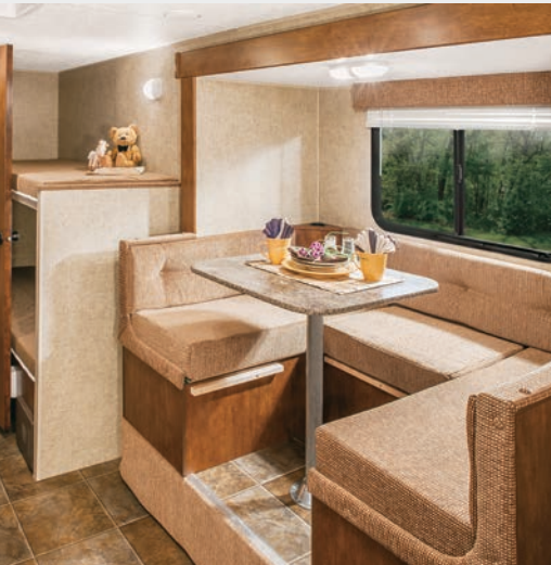
Dining areas are bright and cheerful, with large windows providing additional lighting, and many floorplans offer convertible dinette sleeping areas.