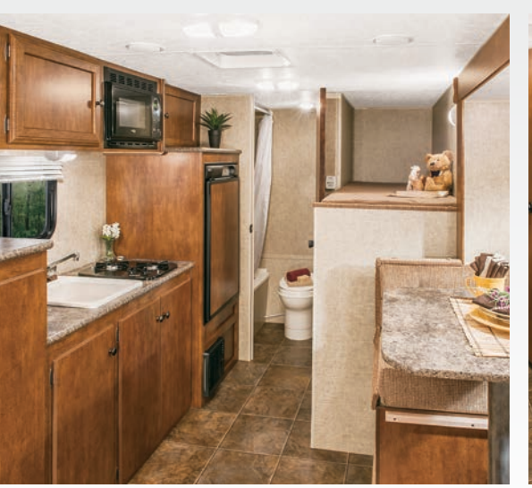
Kitchens are smartly designed for efficient workflow, and include microwave, gas/electric refrigerator and 2-burner stovetop. Ample storage opportunities abound.