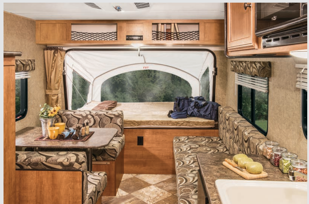
Some Classics are available with expandable foldout bunkends, which offer the ambience of tent camping with the security of solid walls and locking doors. Expandables provide additional living and sleeping space without adding towing length and weight. Sportsmen Classic uses 4-inch-thick bunkend cushions, and Aqualon tent fabric throughout that comes with a 5-year warranty.

Sportsmen Classic provides all the amenities of home in a lightweight, easy to tow package. Classic is versatile and offers your family comfortable, flexible floorplans in a variety of configurations, including expandables, hardsides and even toy haulers.