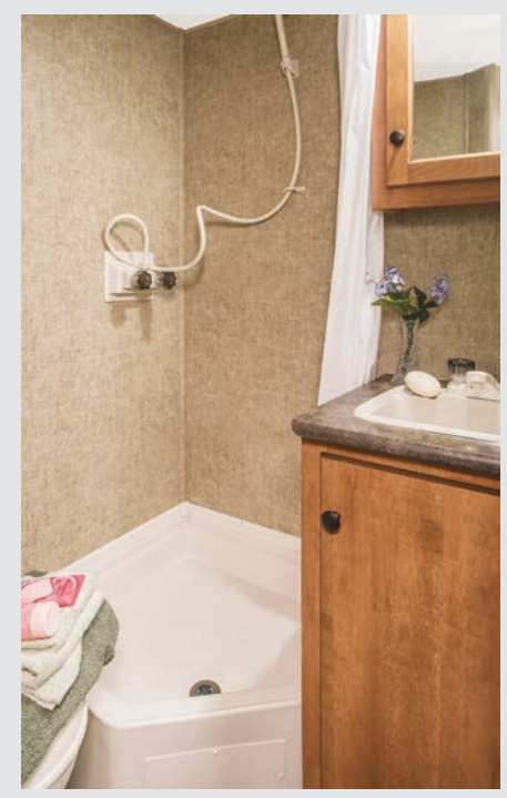
Bath areas are bright and airy, with plenty of room and storage. All offer a shower and toilet (18RBT three-piece bath shown).