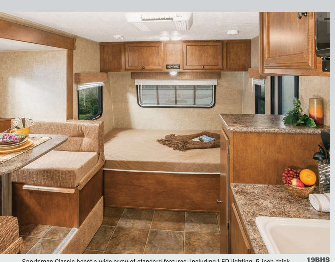
Sportsmen Classic boast a wide array of standard features, including LED lighting, 5-inch-thick dinette cushions, mini blinds, easy-clean linoleum throughout, plenty of counter space and large overhead cabinets.