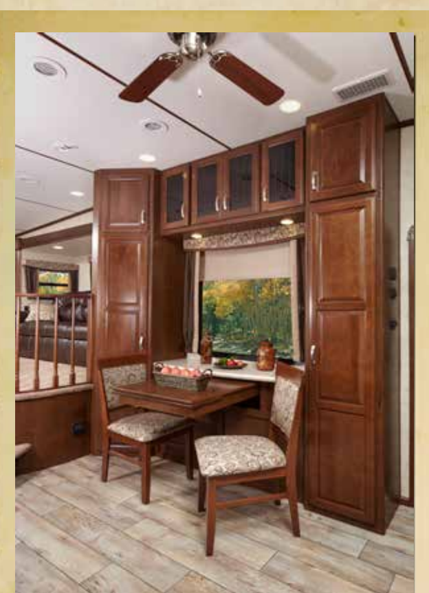
Lincoln with pull-out buffet

Rushmore is as elegant and prestigious inside as it is out. This modern fifth wheel was developed with you in mind. Equipped with all the features, options and amenities you could wish for in any RV. Rushmore lets you choose the exact interior to fit your lifestyle, with rich dark maple cabinets and three designer inspired interior decor choices. For Maximum entertainment, the large 48" LED HD TV with sound bar is your private home theater. The joy of an RV is that no matter where you go, you are always at home. And at the end of the day, that means happily home in your own bed. The Rushmore tucks you comfortably in a I-Cool Memory Foam queen mattress. You'll appreciate other four-star touches, too, like the large wardrobes with plenty of drawer space and a 32" LED HD TV.