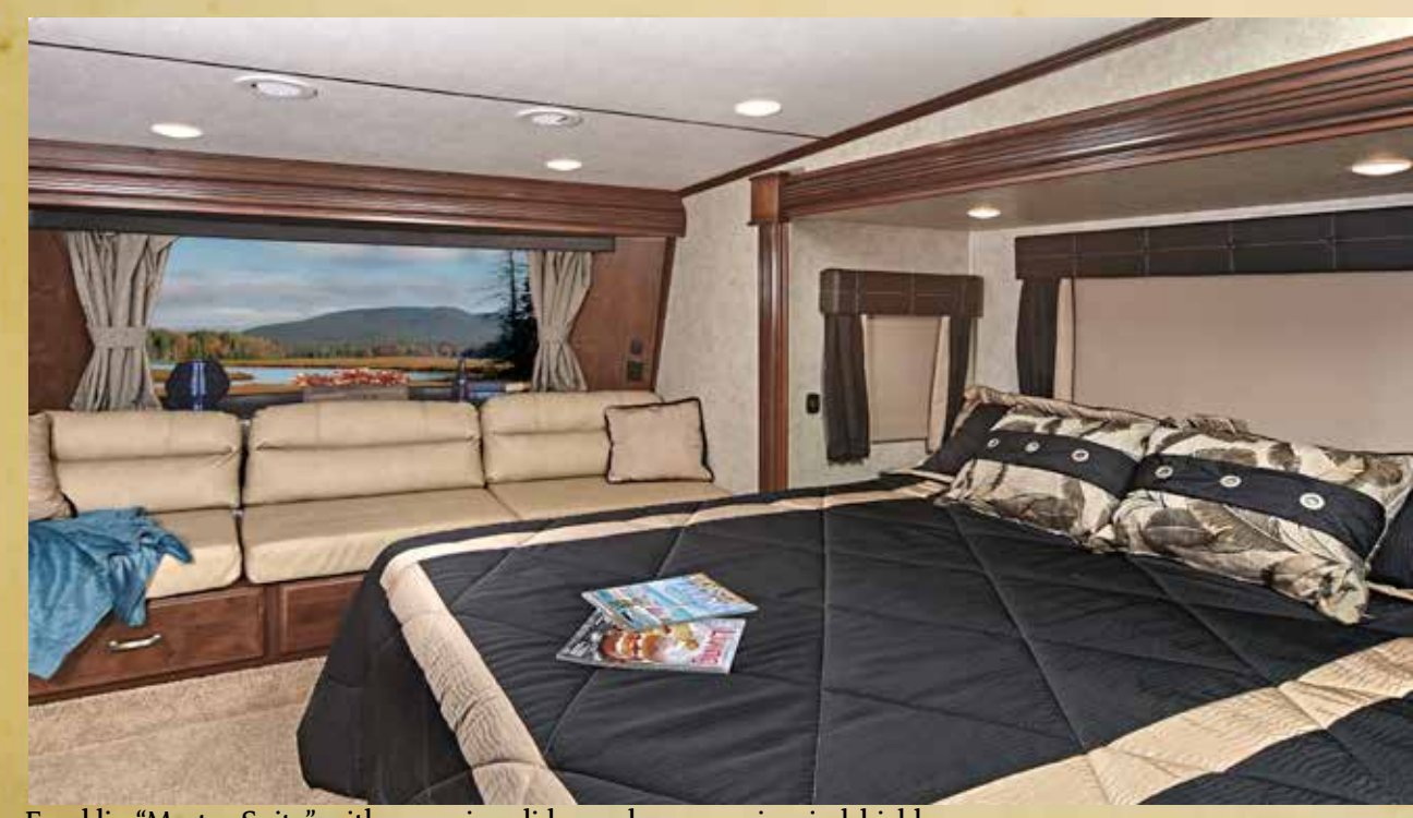
Franklin "Master Suite" with opposing slides and panoramic windshield