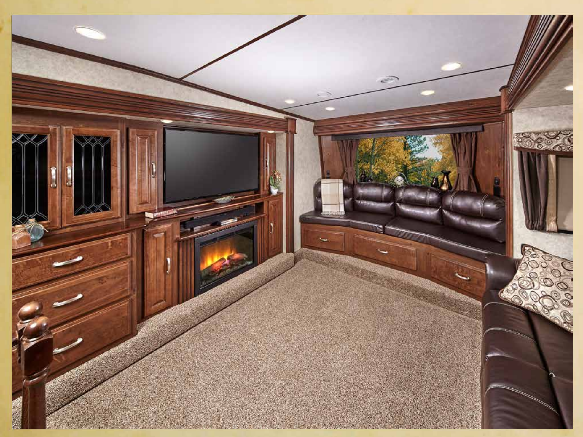
Lincoln front living room with panoramic windshield in the Dune decor.