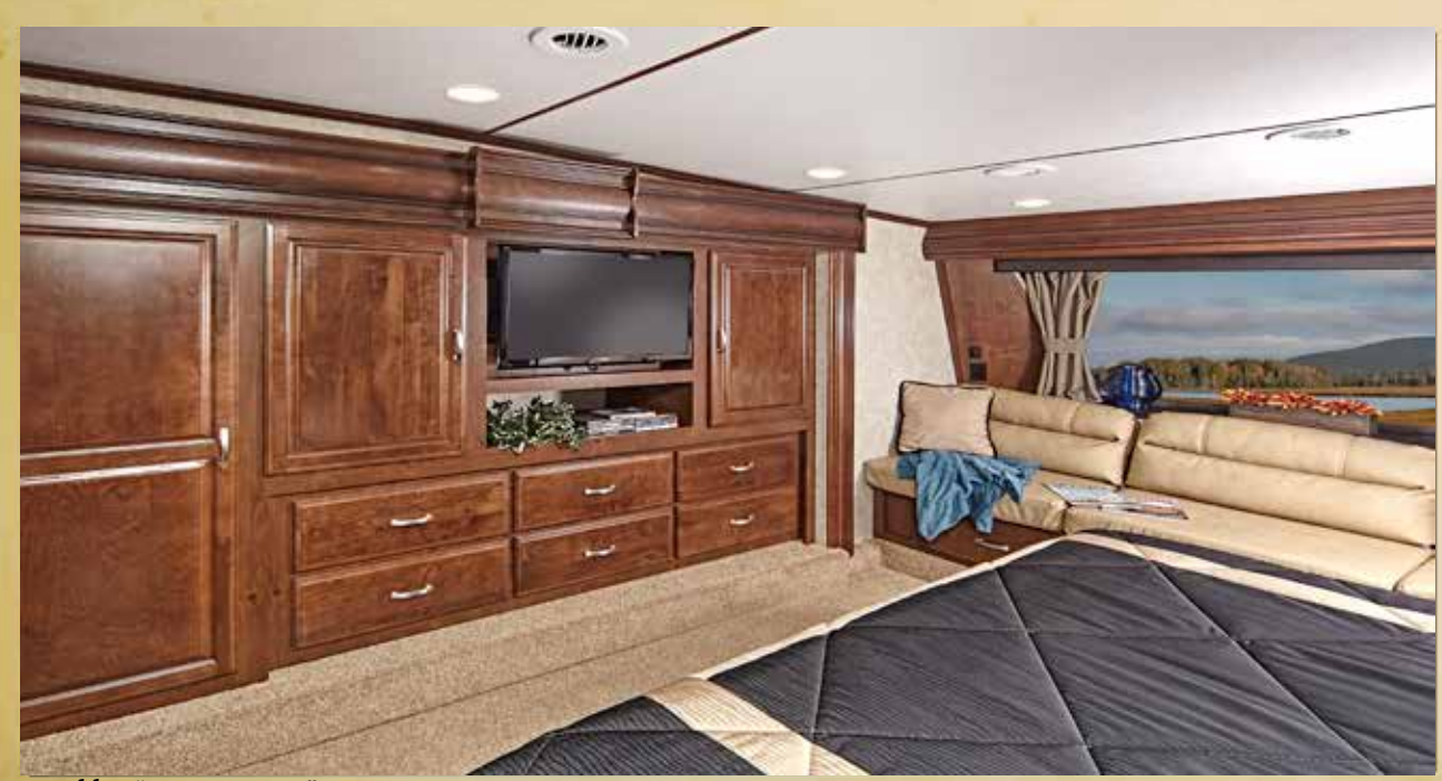
Franklin "Master Suite"