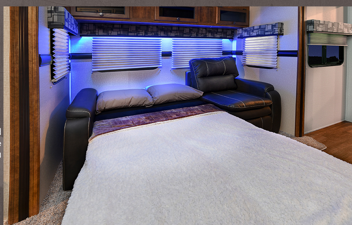
Hide A Bed Feature in Main Area