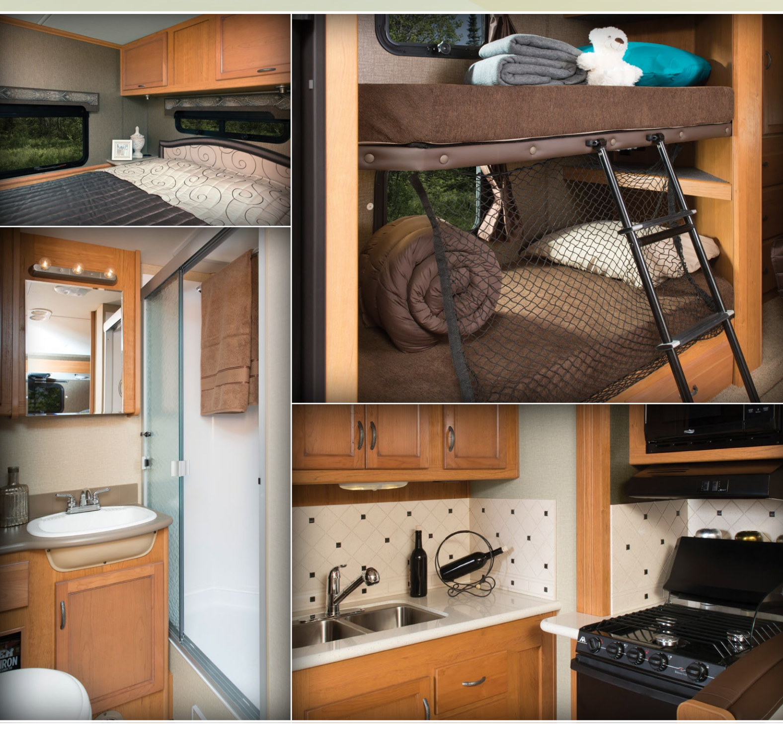
Embark on adventures, large and small. The perfect companion for all tours across the countryside, Admiral brings life and exploration to your doorstep. Breathe in thrill of Mother Nature's wake-up call and retire in the comfort of home anywhere your dreams lead you. Admiral is ready! Are you?