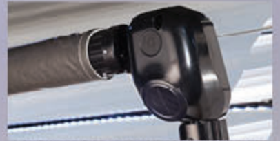
INTEGRATED AWNING SPEAKERS W/ LED LIGHT STRIP