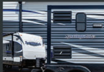
FULL BODY GRAPHICS