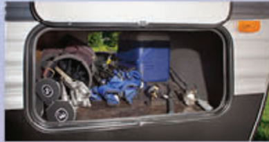
EXTRA LARGE PASS THRU STORAGE DOOR