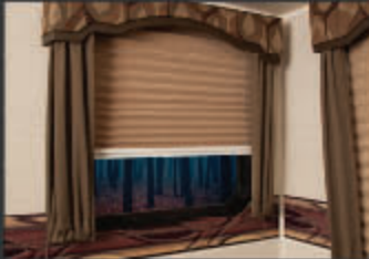
PLEATED NIGHT SHADES