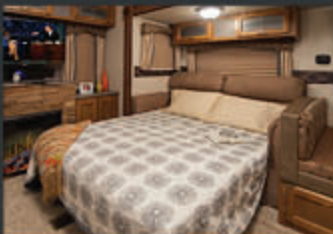
TRI-FOLD SLEEPER SOFA