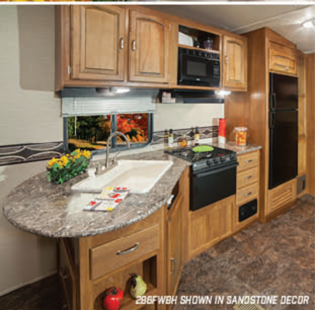
286FWBH SHOWN IN SANDSTONE DECOR