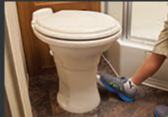
PORCELAIN FOOT FLUSH TOILET