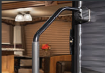
EXTRA LARGE ENTRY HANDLE