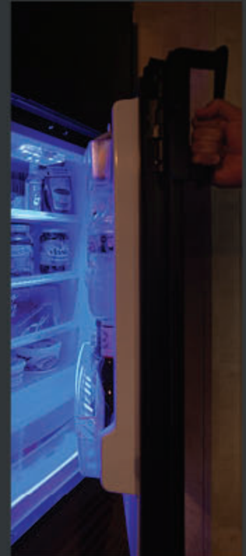
UPGRADED 7 CU. FT. REFER W/LED LIGHT