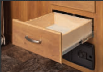
FULL EXTENSION BALL BEARING ROLLER GUIDES