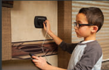
DIGITAL CHARGING STATION