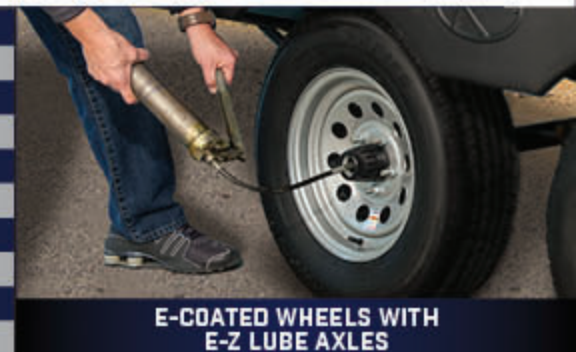
E-COATED WHEELS WITH E-Z LUBE AXLES