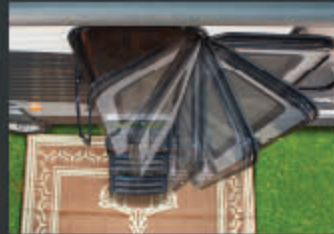
FRICTION HINGE DOOR