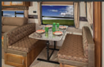
"DO-MORE" DINETTE TABLE