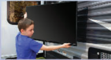
OUTDOOR TV BRACKET W/TV HOOKUP