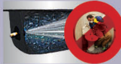
BLACK TANK FLUSH