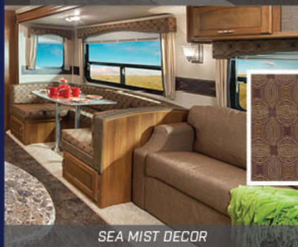
SEA MIST DECOR