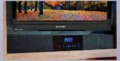
SOUND BAR ENTERTAINMENT CENTER