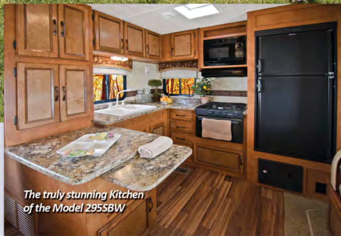
The truly stunning Kitchen of the Model 295SBW