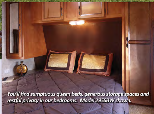
You'll find sumptuous queen beds, generous storage spaces and restful privacy in our bedrooms. Model 295SBW shown.

Where Experience and Innovation Come Together