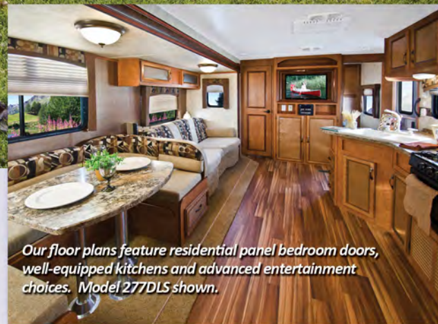
Our floor plans feature residential panel bedroom doors, well-equipped kitchens and advanced entertainment choices. Model 277DLS shown.