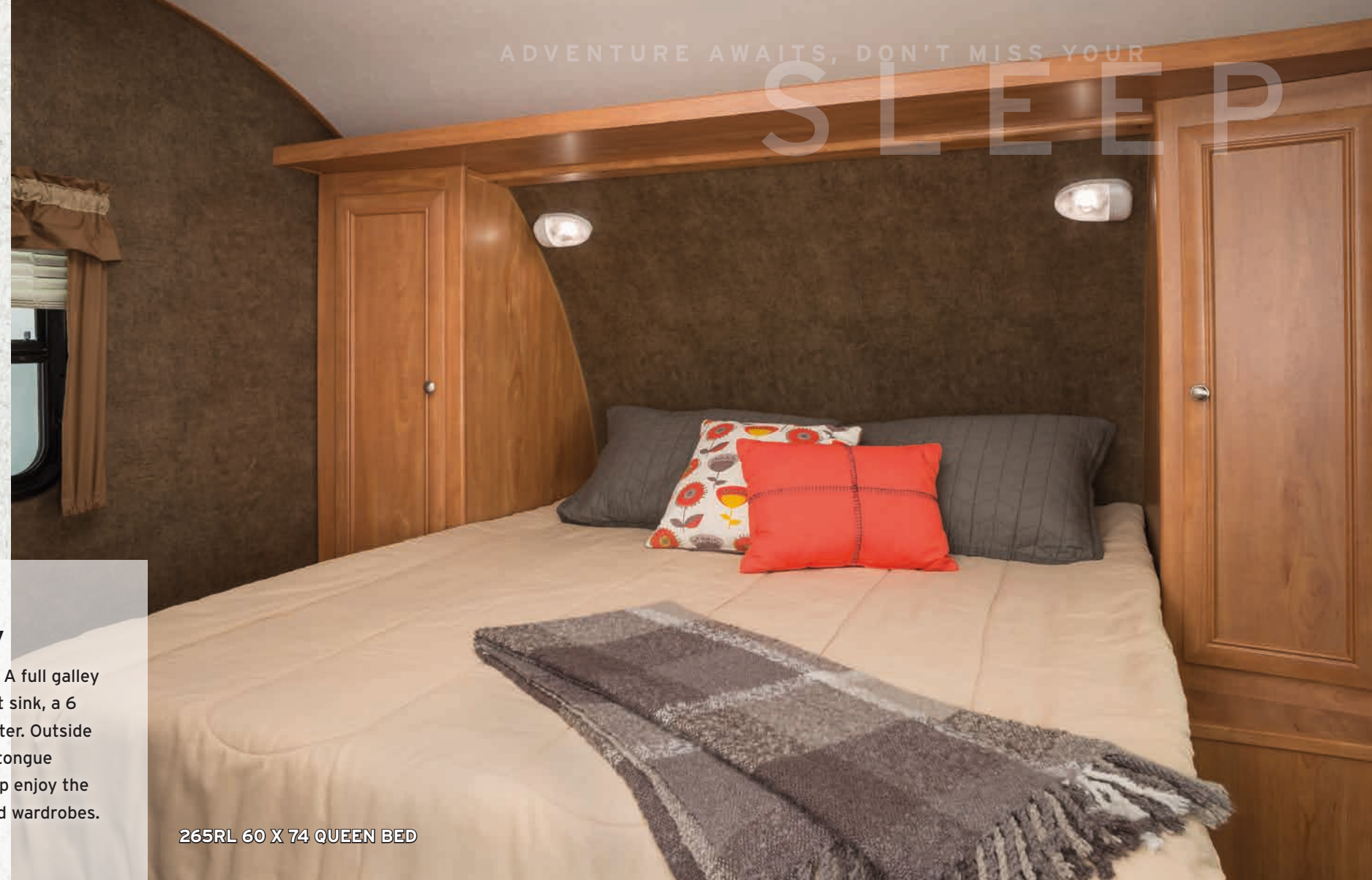
265RL 60 X 74 QUEEN BED