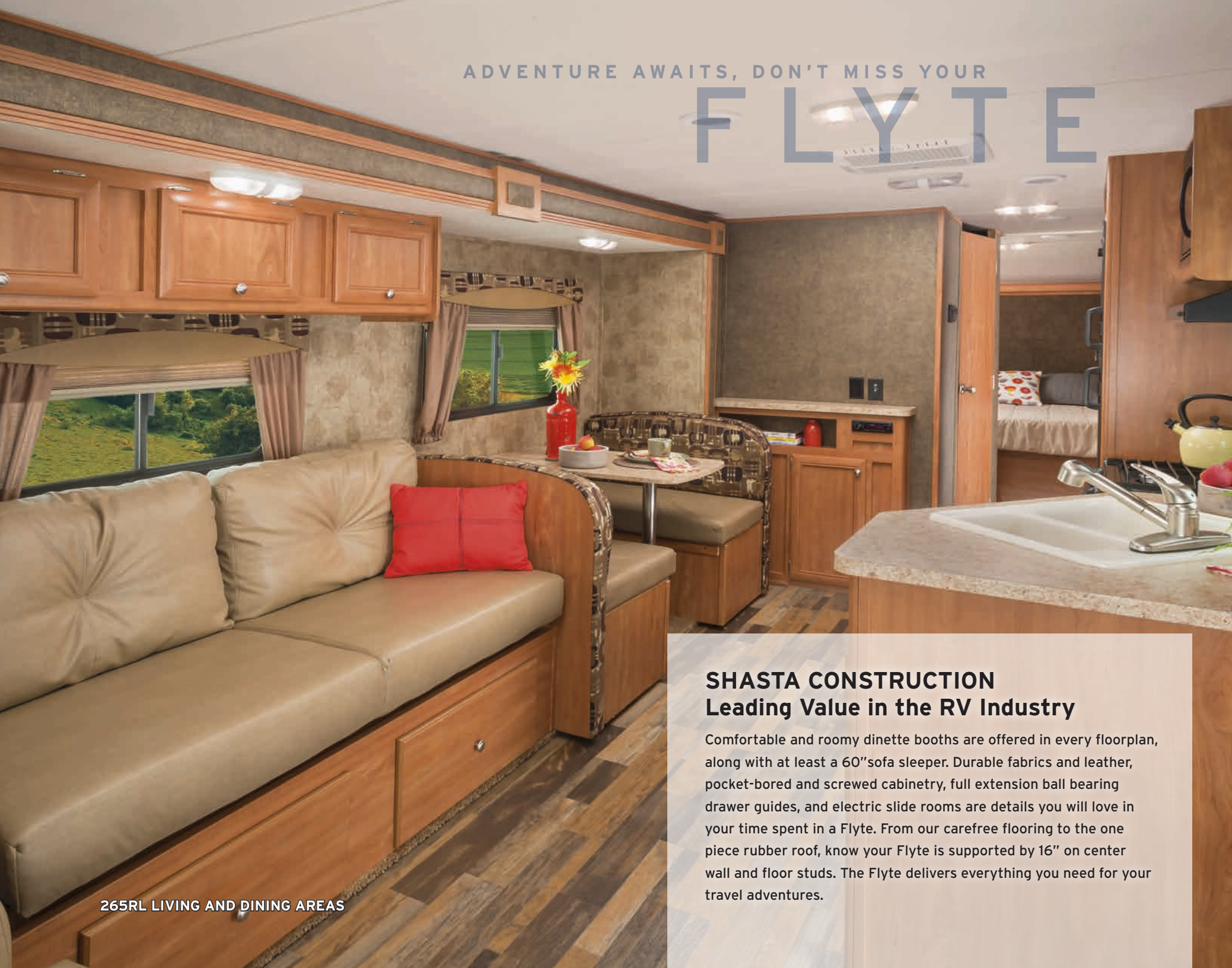
265RL LIVING AND DINING AREAS