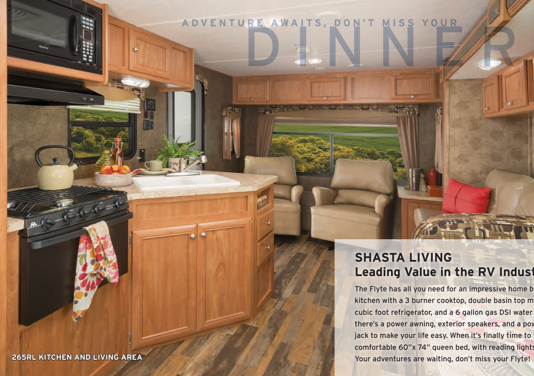
265RL KITCHEN AND LIVING AREA

ADVENTURE AWAITS, DON'T MISS YOUR DINNER