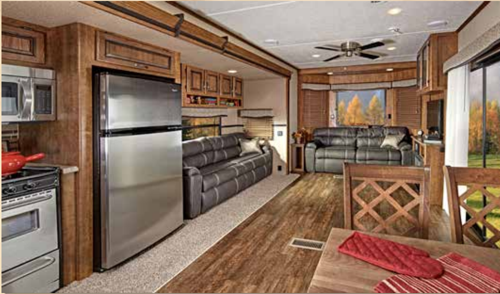
HT400FL Living Area in Armani Decor