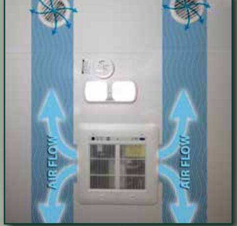
DUAL DUCTED A/C

Easy setup and adjustment. The LED Increased and even cool airflow light strip lights your patio long into the night