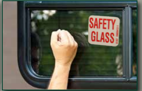
STRONG SAFETY GLASS

Protects your investment from road debris and looks great too.