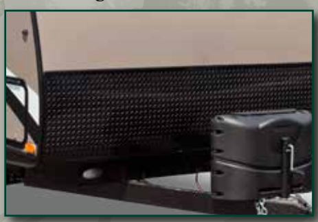
DIAMOND PLATE PROFILE

Virtually glide over bumps and holes in The perfect solution for messy feet and washing pets. Keep the mess outside.