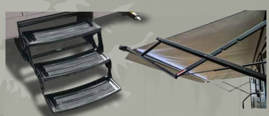
RADIUS ENTRY STEPS

Quick, easy and no mess solution to cleaning the black tank.