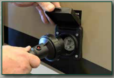
DETACHABLE POWER CORD

Detachable 30 Amp power cord with indicator light.