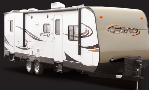
T2850 Shown w/ optional Fiberglass Exterior