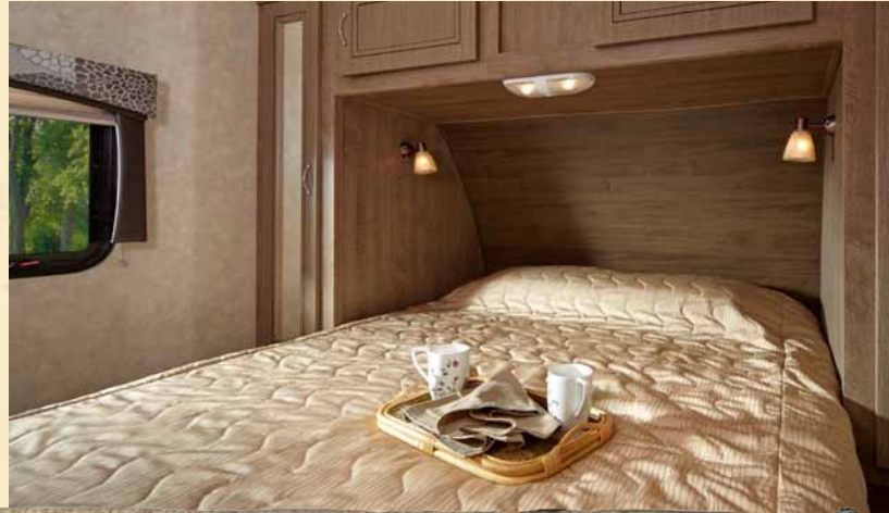
BEDROOM: Lots of storage under this Queen bed in the private bedroom with many other amenities.