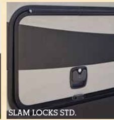
SLAM LOCKS STD.