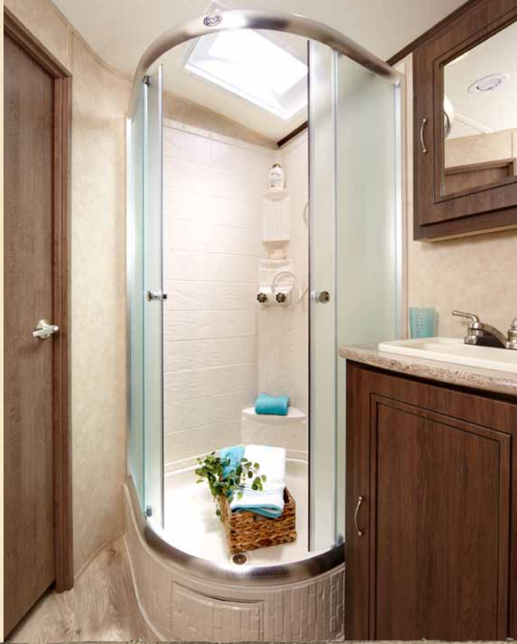
SHOWER: Radiused glass shower enclosure on all corner shower models is top of the line.