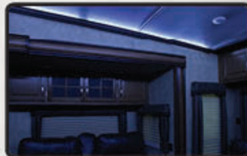
BACK-LIT CROWN MOLDING AMBIENT CEILING LIGHT