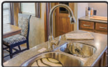
70/30 SINK W/PULL OUT FAUCET