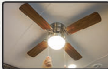
CEILING FAN WITH LIGHT KIT