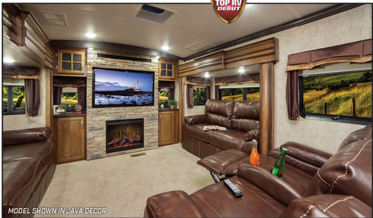
MODEL SHOWN IN JAVA DECOR