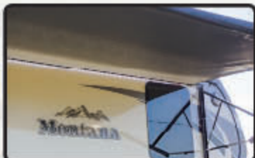
AWNING WITH LED LIGHT STRIP