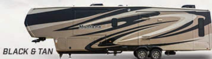
BLACK & TAN