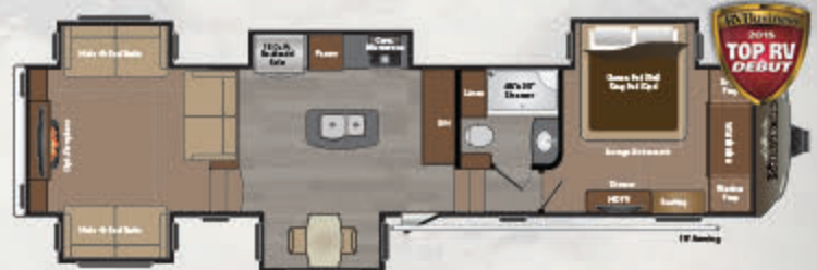
3790RD - RV REFRIGERATOR 3791RD - RESIDENTIAL REFRIGERATOR