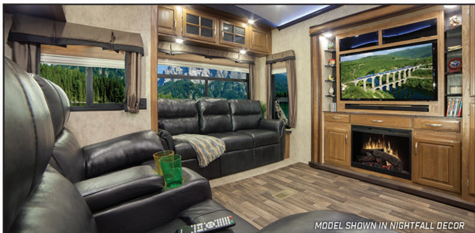
MODEL SHOWN IN NIGHTFALL DECOR