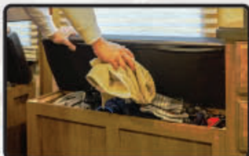
BUILT IN BEDROOM WINDOW SEATING W/LAUNDRY HAMPER