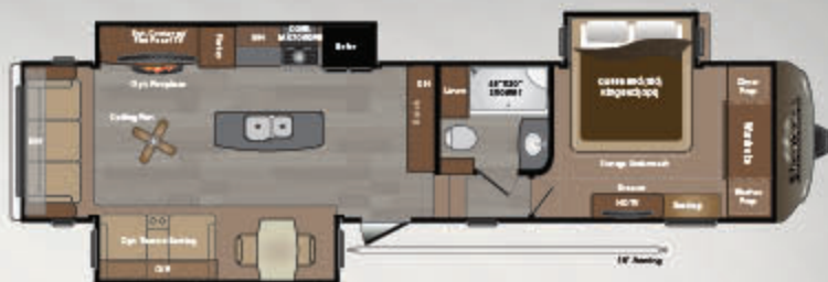
3610RL - RV REFRIGERATOR 3611RL - RESIDENTIAL REFRIGERATOR

Keystone disclaims any liability or damages suffered as a result of the selection, operation, use or misuse of a tow vehicle. KEYSTONE'S LIMITED WARRANTY DOES NOT COVER DAMAGE TO THE RECREATIONAL VEHICLE OR THE TOW VEHICLE AS A RESULT OF THE SELECTION, OPERATION, USE OR MISUSE OF THE TOW VEHICLE. REFERENCE KEYSTONE RV COMPANY OWNERS MANUAL FOR LIMITED WARRANTY DETAILS.*Length is defined as the distance from the centerline of hitch pin/coupler to rear bumper of trailer. 12.14