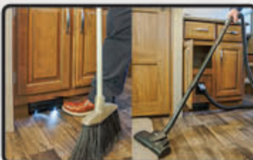
CENTRAL VACUUM W/KITCHEN TOE KICK & INTERIOR & EXTERIOR HOSE PORTS