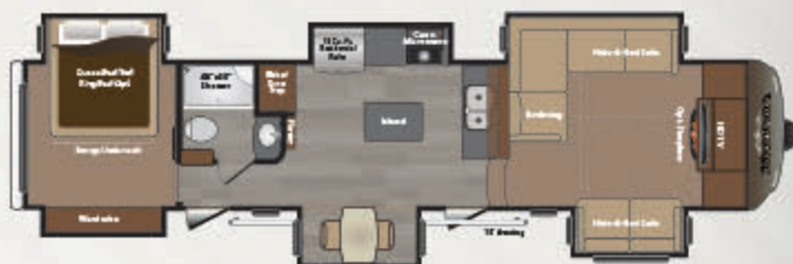
3710FL - RV REFRIGERATOR 3711FL - RESIDENTIAL REFRIGERATOR