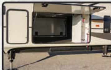
DROP FRAME CONSTRUCTION WITH MASSIVE STORAGE