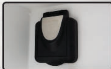
SOLAR PANEL PREP