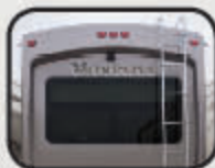
Metallic Nickel Painted Fiberglass Rear Cap (N/A 3790, 3791)