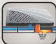
Quiet Cool Air Conditioning System