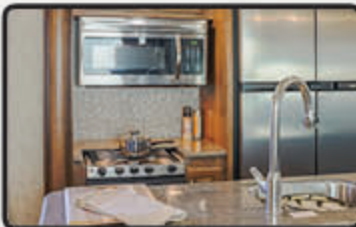
SOLID SURFACE FLUSH STOVE & SINK COVERS WITH DESIGNER BACKSPLASH