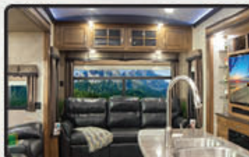
ACCENT LIGHTING ARCHED CEILING