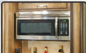
30" RESIDENTIAL CONVECTION MICROWAVE