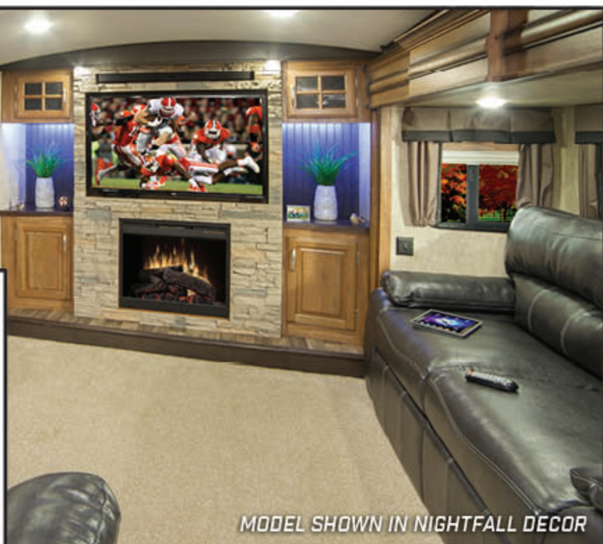
MODEL SHOWN IN NIGHTFALL DECOR