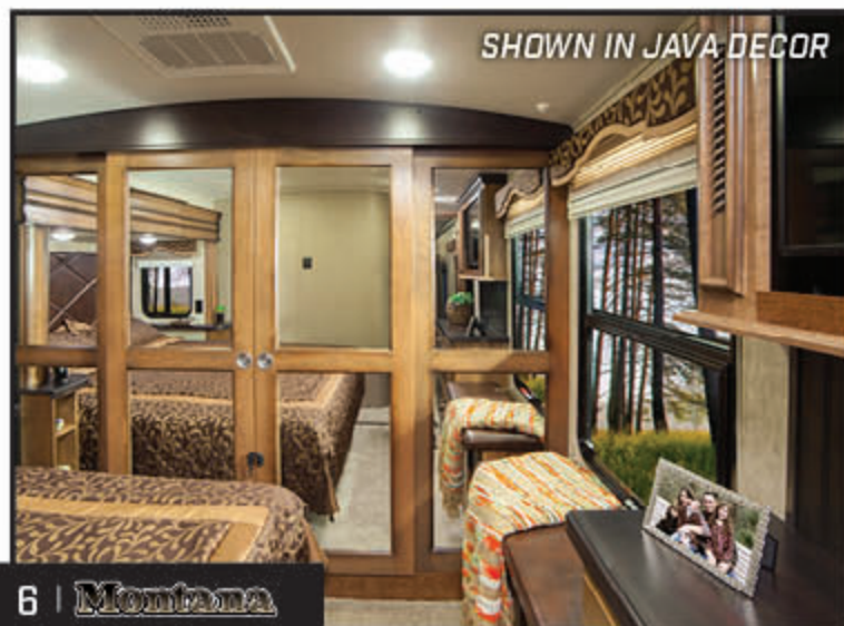
SHOWN IN JAVA DECOR