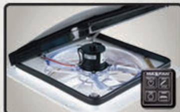
POWER RAIN SENSOR VENT FAN W/ MULTI-SPEED WALL CONTROL