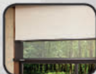
MCD Day/Night Roller Shades (Living Area Only)