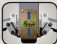
Exclusive MOR/Ryde LRE 4100 Suspension