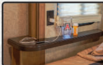
WRAP AROUND HARDWOOD NIGHT STANDS W/OUTLETS AND CUBBY STORAGE