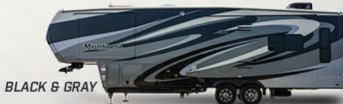
BLACK & GRAY