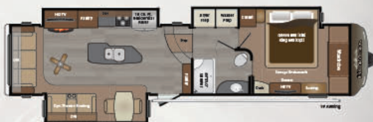
3720RL - RV REFRIGERATOR 3721RL - RESIDENTIAL REFRIGERATOR