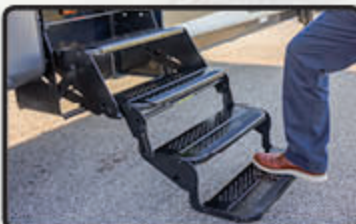
CONVENIENT FOUR STEP ENTRY