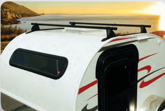
Yakima™ Roof Rack — Want to slap on a cargo basket, some skis or a kayak? Here's your answer! Available on all models except for the myPod.