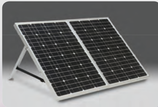
Solar Panel — Chase the sun and keep your trailer powered at all times! *Every trailer that leaves our building is prepped for solar charging.