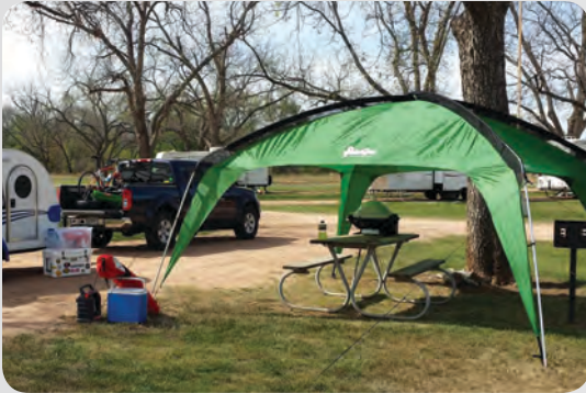
Cottonwood Shelter — Escape the rain or enjoy the shade with this lightweight dome that covers your key camping space.