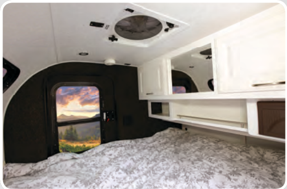
Featuring a near, queen-sized sleeping area, the 5-Wide Little Guy was designed to be ideal for 2 adults, a couple of kids and/or some pets! The overhead cabinetry has 2, large, upward swinging cabinet doors that frame a mirror (or 19" TV)