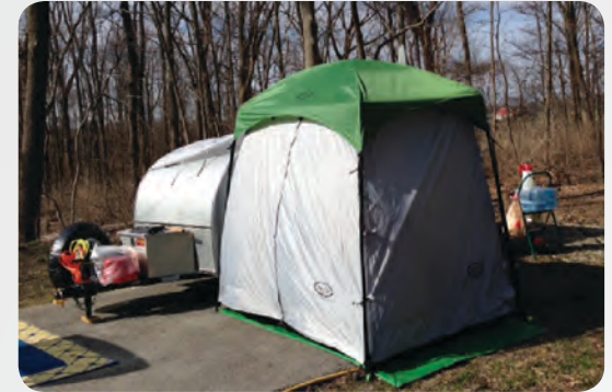
Custom 5x7 Tent — A smaller version of the 10x10 but with all the same benefits, specifically speaking, a place for privacy!