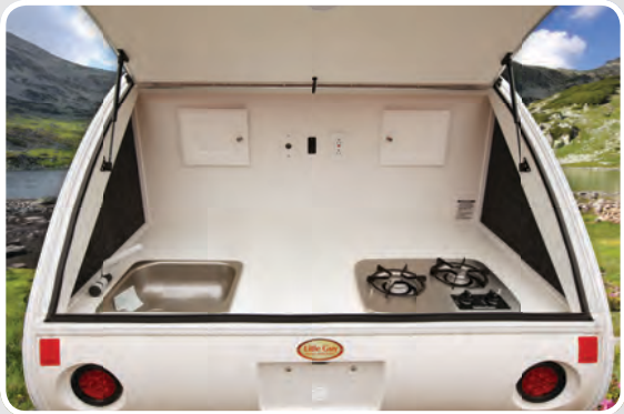
The back hatch opens to reveal a convenient galley where you can choose to drop in a sink and stove or you can simply opt to have a large storage or prep area.

LITTLE GUY. Serving as the 'original flagship' for the company, this modern teardrop - with a casual twist - has been our most popular model for several years. It is available in 4' 5' and 6' wide and can be equipped with an off-road package for those hard to reach campsites. <<