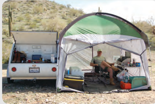
Custom 10x10 Tent — Gain 100 sq. ft. of living space (for your own use or to accommodate guests) with this multi-functional screen room & tent.