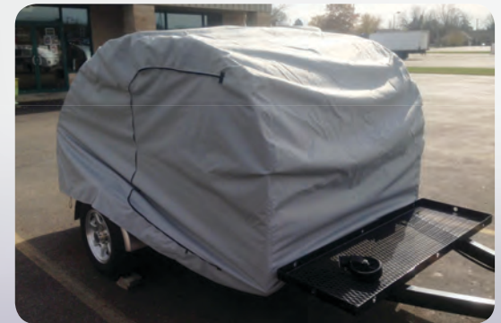
Cover — Protect your teardrop from UV, Acid Rain, Sap and much more...