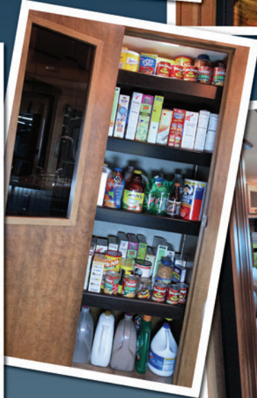
317RST, 337RLS & 357BHS Only