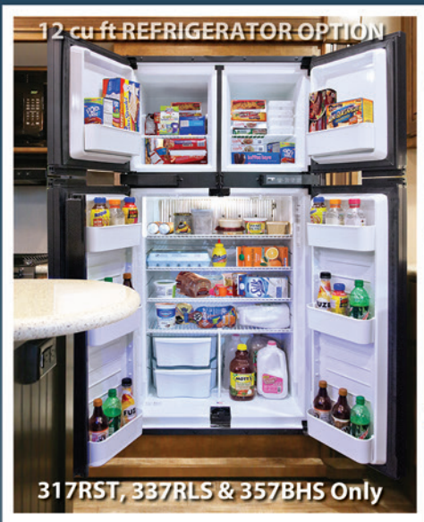
12 cu ft REFRIGERATOR OPTION