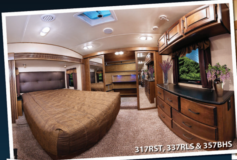
317RST, 337RLS & 357BHS