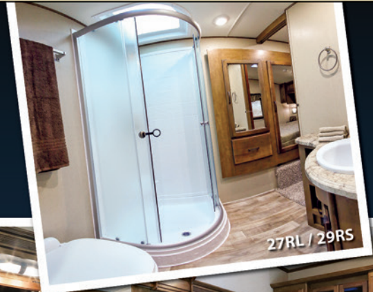
27RL / 29RS