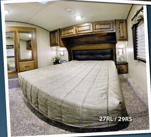
27RL / 29RS