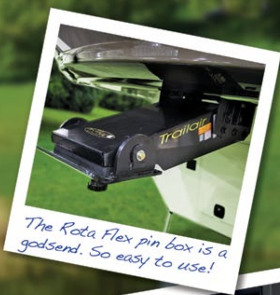
The Rota Flex pin box is a godsend. So easy to use!