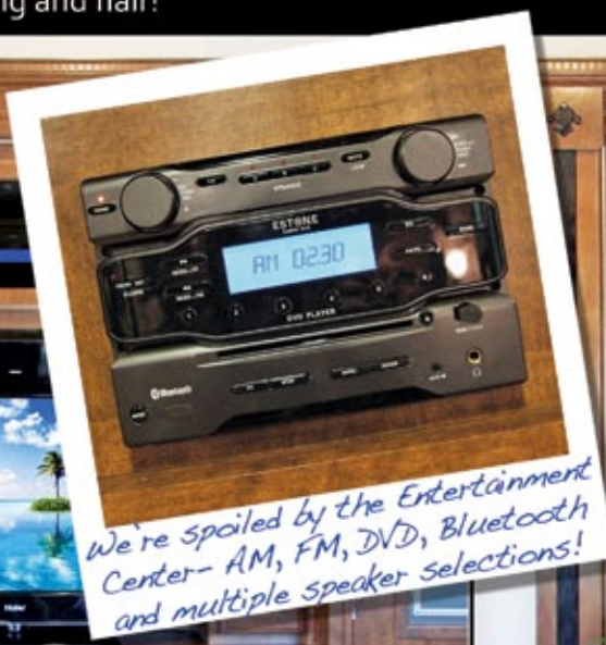
We're spoiled by the Entertainment Center- AM, FM, DVD, Bluetooth and multiple speaker selections!

Hidden amenities are very important to extended-stay living. The comfortable hide-a-bed sofa and the pull-out entertainment center computer desk deliver with exceptional engineering and flair!