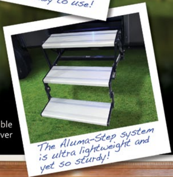
The Aluma-Step system is ultra lightweight and yet so sturdy!

Hidden amenities are very important to extended-stay living. The comfortable hide-a-bed sofa and the pull-out entertainment center computer desk deliver with exceptional engineering and flair!