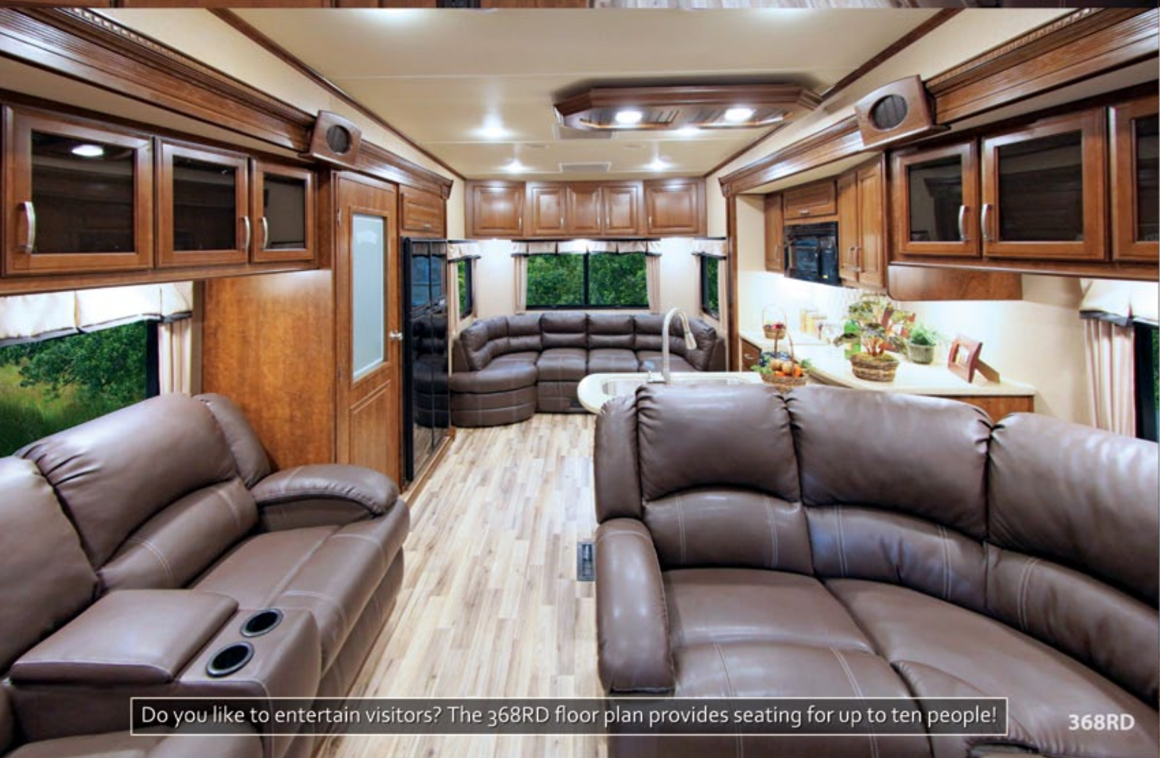
Do you like to entertain visitors? The 368RD floor plan provides seating for up to ten people!