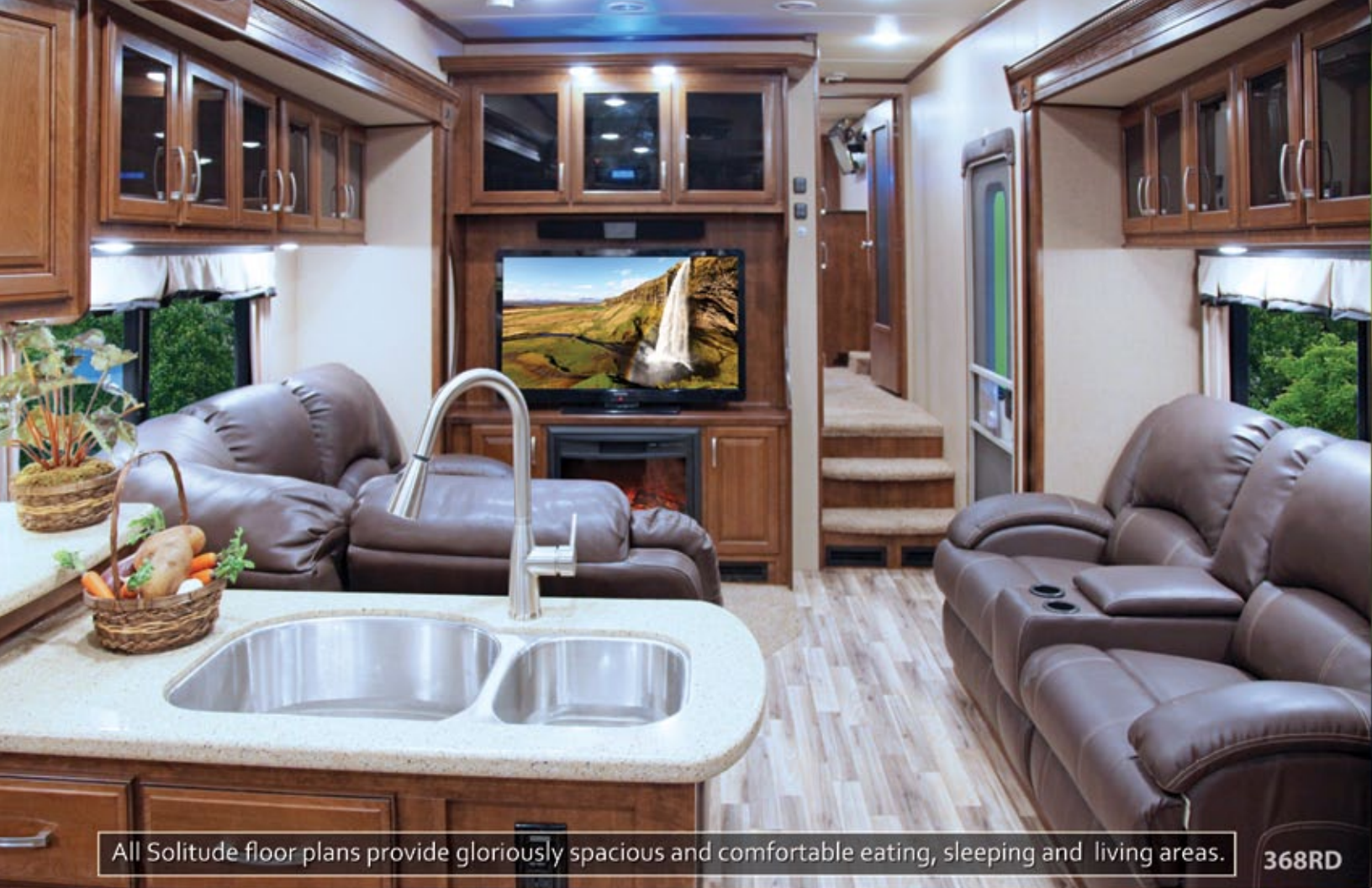
All Solitude floor plans provide gloriously spacious and comfortable eating, sleeping and living areas.