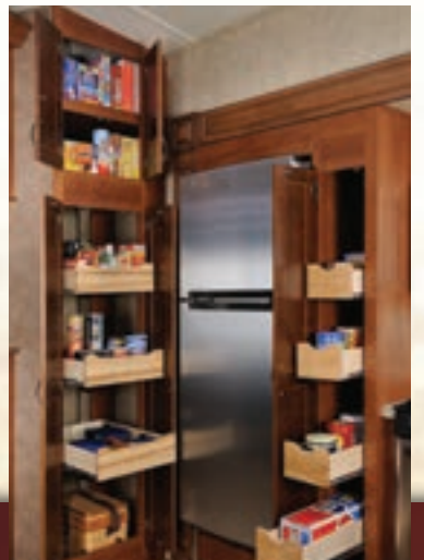
This family-friendly bunk house fifth wheel is big on storage space. The standard 12' Super Sofa with two sliding table tops creates a comfortable lounge area for eight people or a pull-out sleeper sofa for extra friends.

The kitchen is the center of daily activity. 37BH is loaded with storage including this abundant floor-to-ceiling pantry, available with your choice of an optional electric 11 cu. ft. or a 13 cu. ft. side-by-side refrigerator.