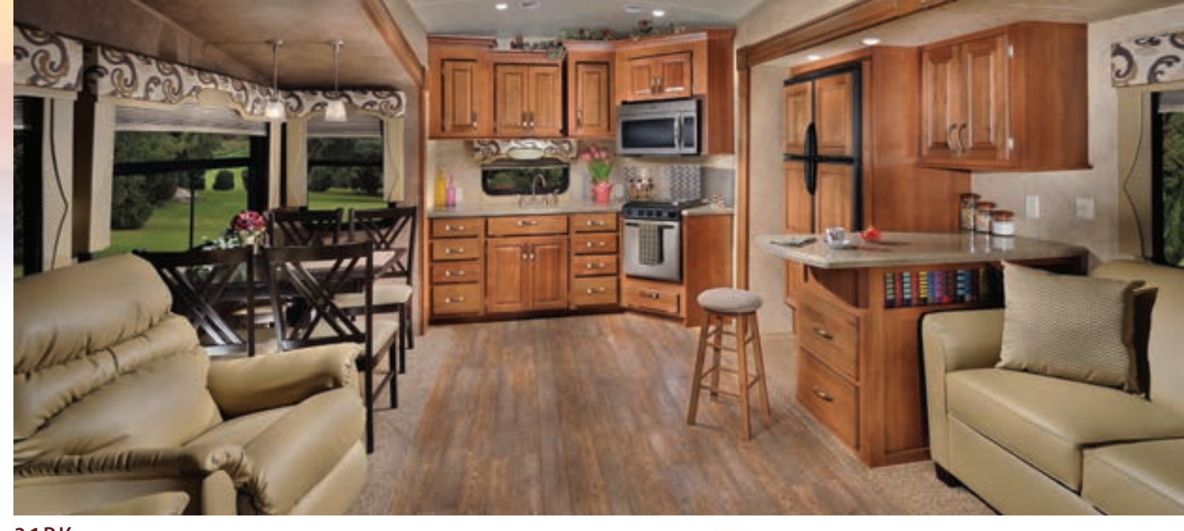
31RK \ \ \, \textit{This open rear kitchen has generous storage and counter space to accommodate an optional 13 cu. ft. \textit{gas/electric, side-by-side refrigerator.} \\