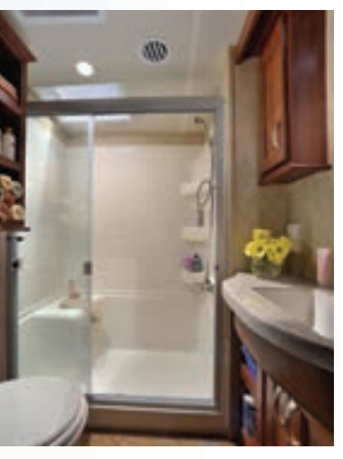
Silverback's luxurious bath includes a large 48" shower with glass doors, porcelain toilet, and a Fantastic Fan with a wall switch.

All Weights listed above are base weights. Weight capacities +/- 5%. NOTE: All fifth wheel lengths include extended pin box and 4" bumper. Model number of any particular unit does not necessarily reflect the overall length of the unit itself.