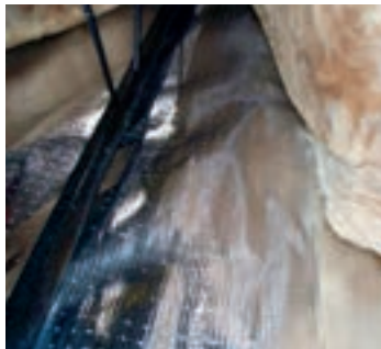
Radiant shield Therma-foil — R-38