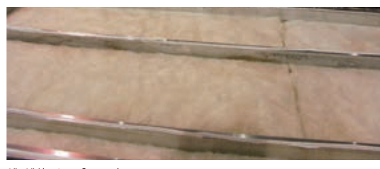
2" x 3" Aluminum floor studs