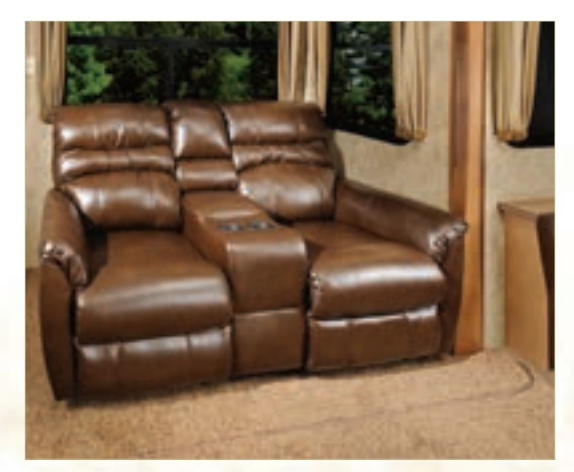
Live life comfortably with our standard La-Z-Boy® sofa sets. Choose Beige or Mahogany recliners, or theater seating for residential comfort that lasts a lifetime.