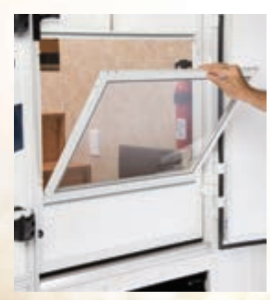
Removable "Soft Top" vinyl storm doors allow light and visibility without losing cooling or heating.