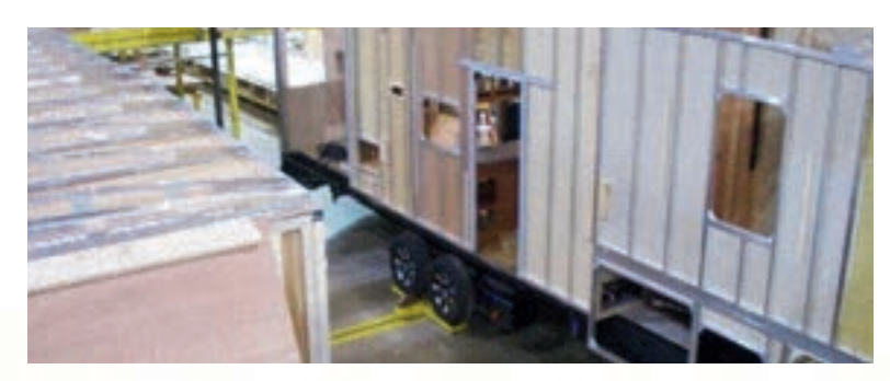
Aluminum studded sidewalls and roof trusses on 16" centers or less