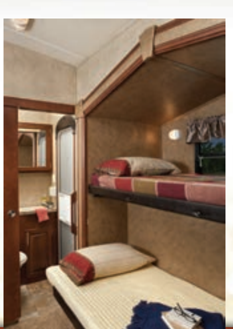
The 35QB4 bunk house provides ample living space for your guests or family. Silverback's exclusive cathedral ceilings in the rear bunkroom slide-rooms provide plenty of headroom above the top bunk. Extra wide 32" bunks can accommodate a choice of two optional tri-fold Comfort Sleep sofas, jackknife sofas, or one of each to maximize sleeping space.

A convenient second bathroom is accessible from the bunk house.