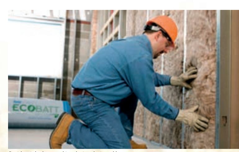
Residential, glasswool insulation designed by nature