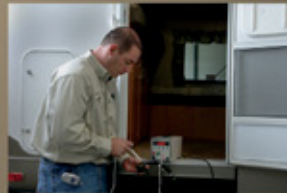
65 Point Secondary PDI