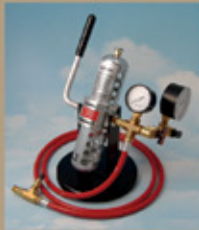
Seek-A-Leak Pressure Test