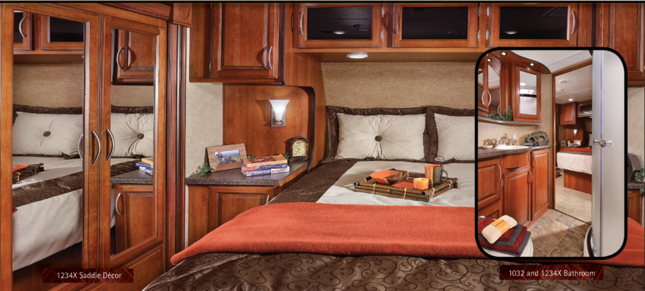
1234X Saddle Décor

As you enter the bathroom, you'll find that Spartan has listened closely to our customers and elevated our design to exceed even the loftiest expectations. With abundant countertop space, large medicine cabinet, and numerous LED lights, you'll have all of the conveniences of home. The intelligent high-rise porcelain toilet, extra-large showers with glass doors, Skyview skylight and clever "STOR-MOR" Shower Caddy will provide a level of comfort only found in Spartan.