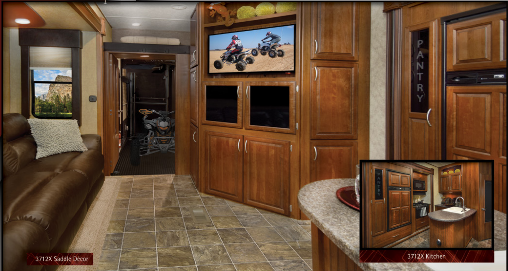
3712X Saddle Décor