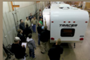
Executive Quality Audits