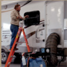
Seal Tech Air Pressure Test

Prime Time Manufacturing is proud to be recognized as an industry leader in value, reliability, and overall quality by the Recreational Vehicle Dealers Association. This was accomplished by committing ourselves to "A Higher Standard" in design, construction, testing, and customer service. Check us out - we know you'll be impressed!