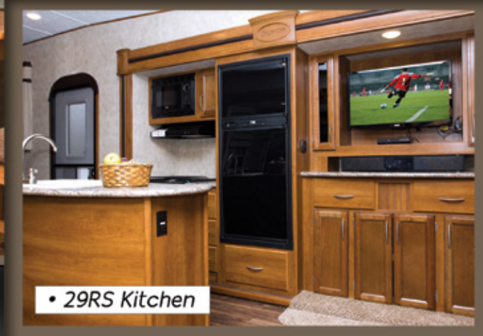
• 29RS Kitchen