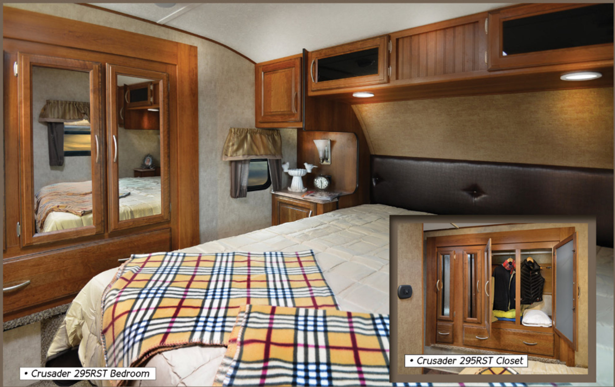
• Crusader 295RST Bedroom