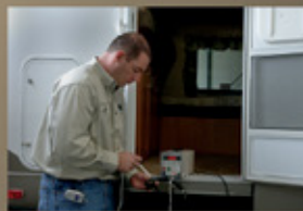
65 Point Secondary PDI