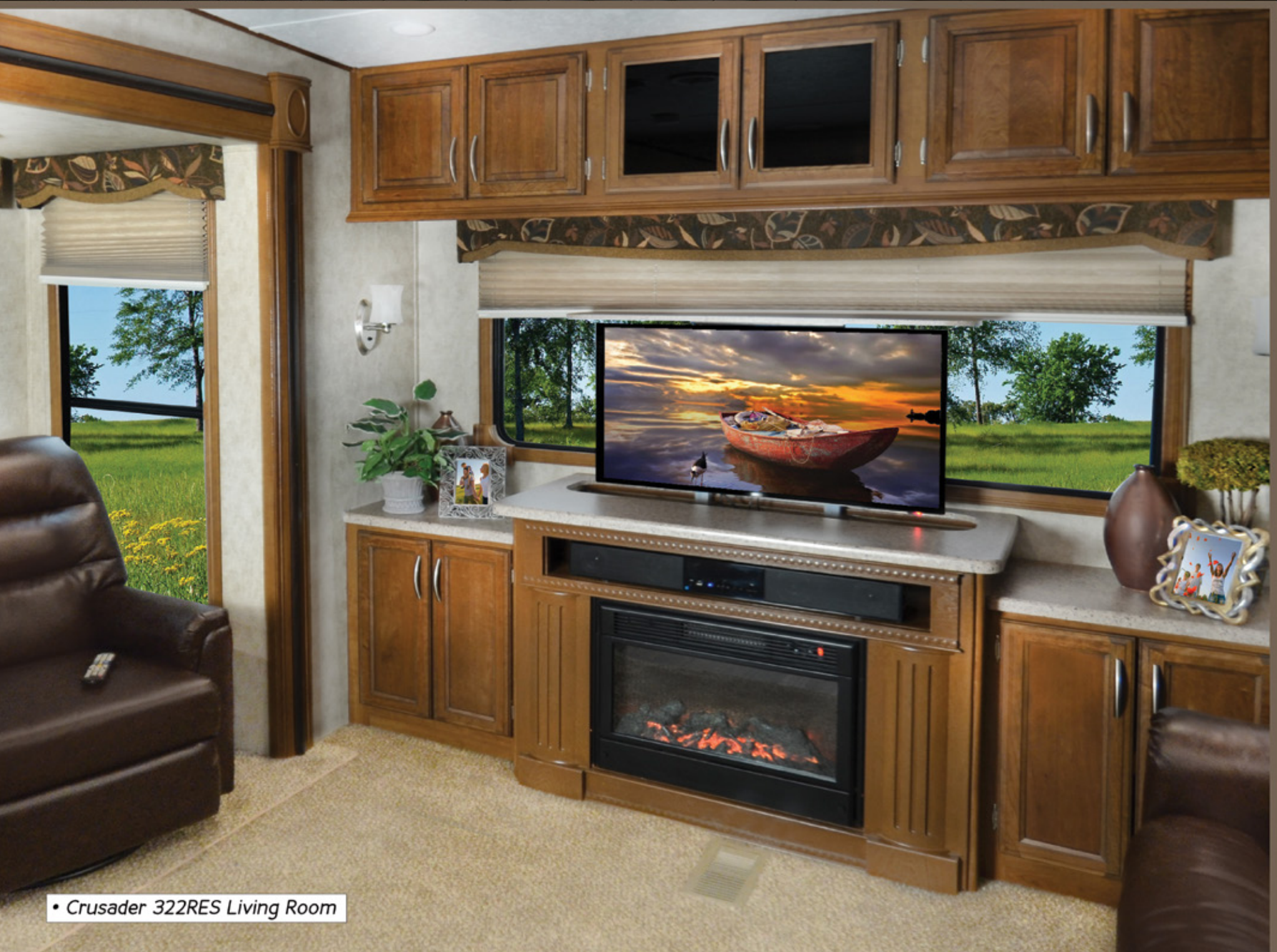
• Crusader 322RES Living Room