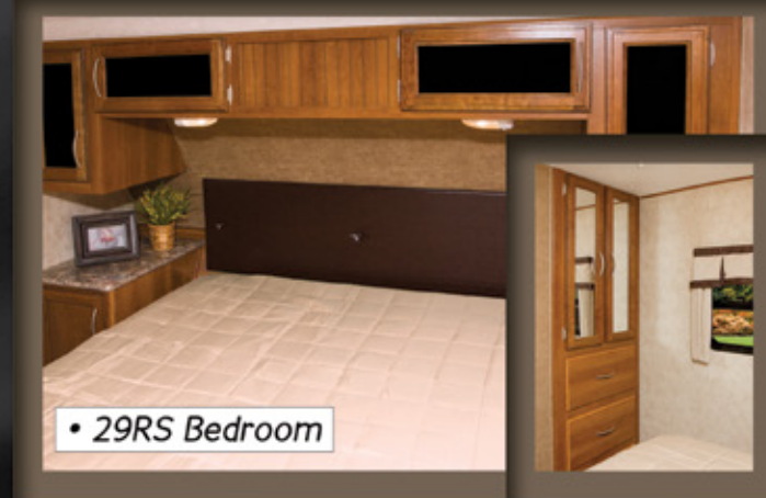
• 29RS Bedroom