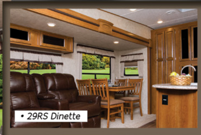
• 29RS Dinette