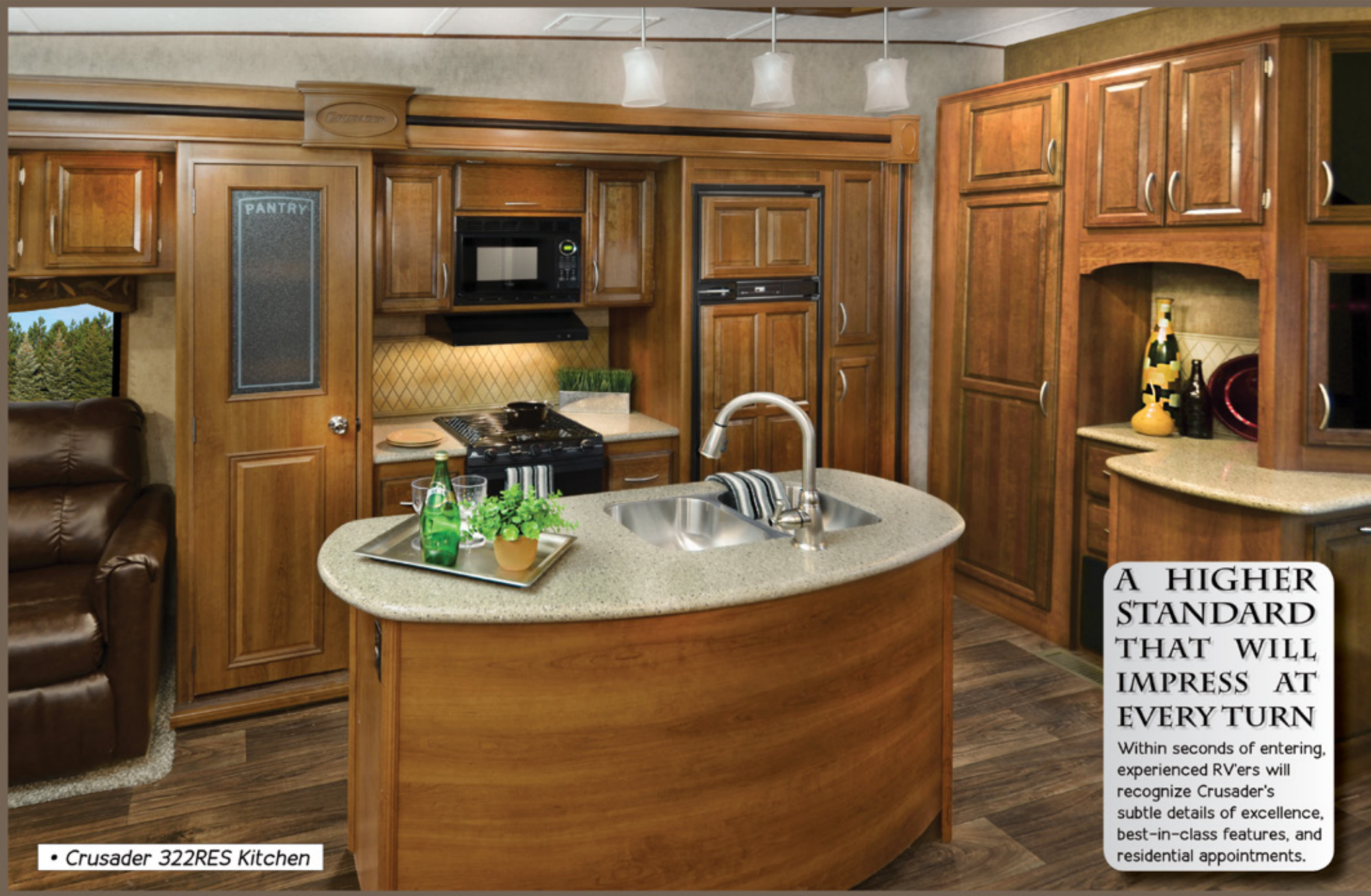
• Crusader 322RES Kitchen

A HIGHER STANDARD THAT WILL IMPRESS AT EVERY TURN