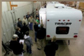
Executive Quality Audits