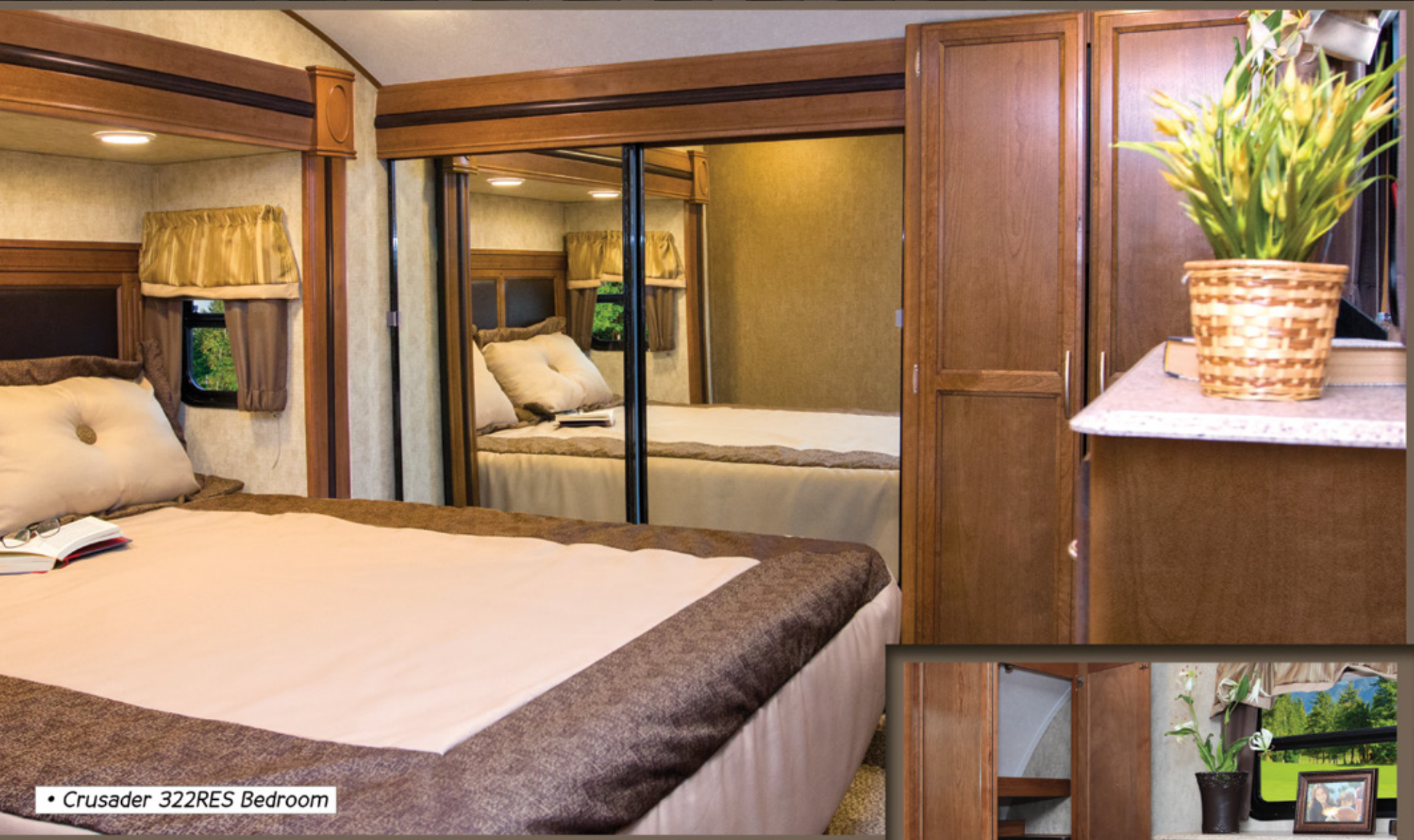
• Crusader 322RES Bedroom

All Crusader bedrooms are built for comfort and convenience. Every Crusader model features large 60" x 80" Ever Rest® select foam beds while several models come standard with a king bed. Crusader bedrooms feel spacious and roomy due to our tall ceilings, they have large storage closets, and our bedroom slide-out models come with the added convenience of washer and dryer preparation. Everywhere you look; there are numerous upgrades that will make your Crusader the envy of the campground.