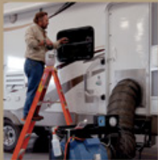
Seal Tech Air Pressure Test

Prime Time Manufacturing is proud to be recognized as an industry leader in value, reliability, and overall quality by the Recreational Vehicle Dealers Association. This was accomplished by committing ourselves to "A Higher Standard" in design, construction, testing, and customer service. Check us out - we know you'll be impressed!