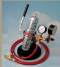
Seek-A-Leak Pressure Test