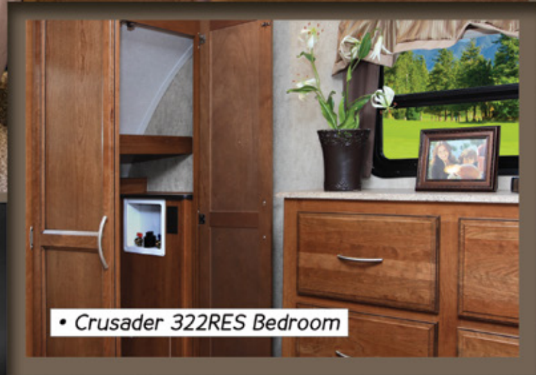
• Crusader 322RES Bedroom

All Crusader bedrooms are built for comfort and convenience. Every Crusader model features large 60" x 80" Ever Rest® select foam beds while several models come standard with a king bed. Crusader bedrooms feel spacious and roomy due to our tall ceilings, they have large storage closets, and our bedroom slide-out models come with the added convenience of washer and dryer preparation. Everywhere you look; there are numerous upgrades that will make your Crusader the envy of the campground.