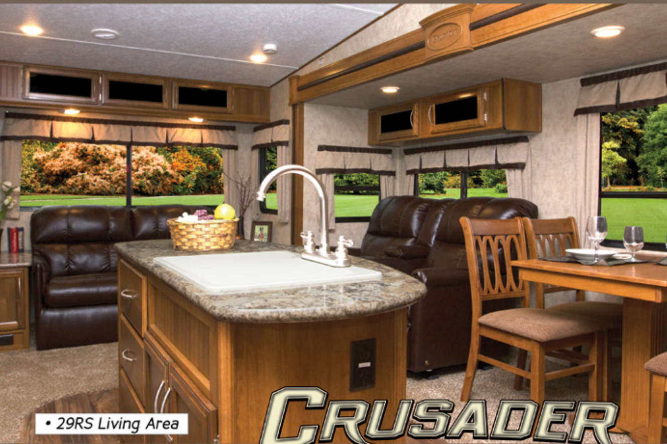
• 29RS Living Area