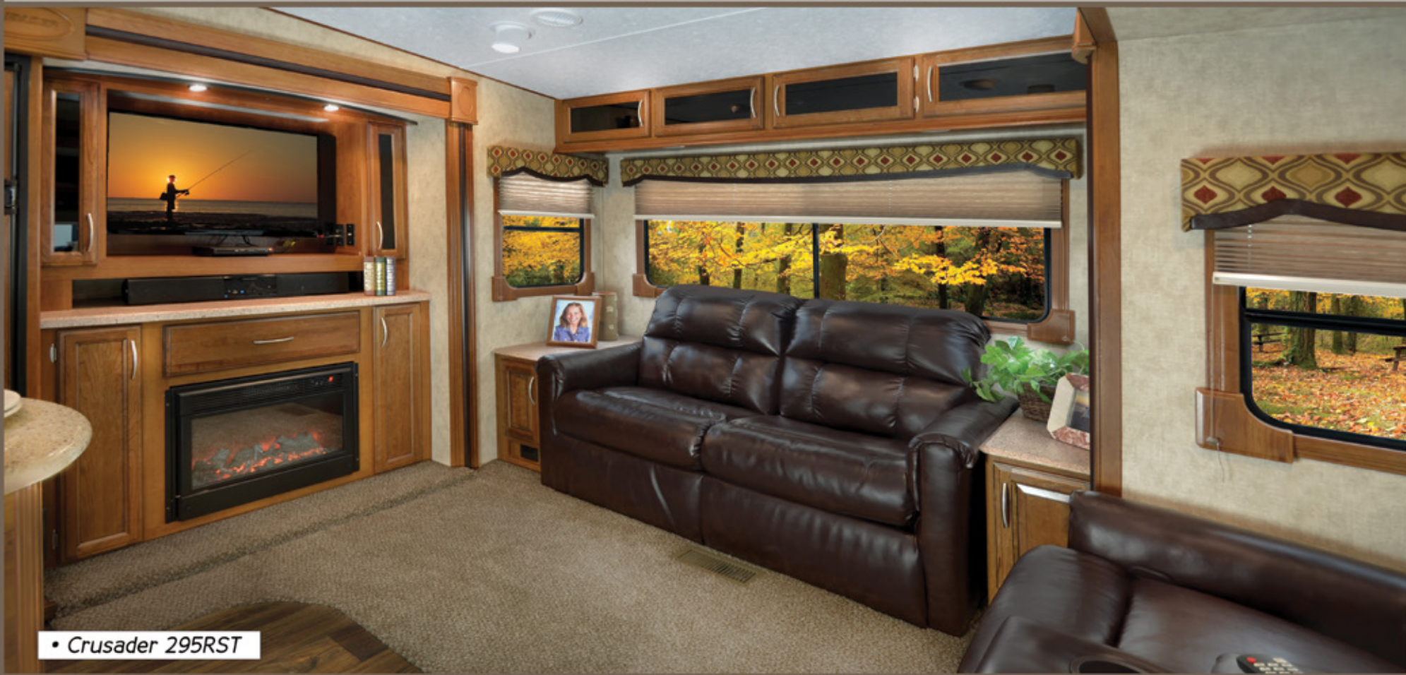
• Crusader 295RST

The result of their efforts represents a new standard in fifth wheels – A HIGHER STANDARD – Crusader.