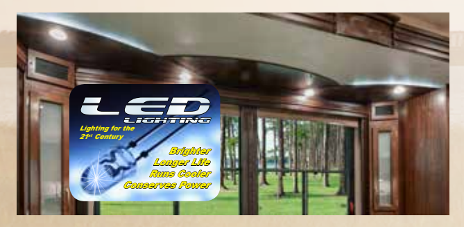
Light your task, set the mood or just kick back and relax. Enjoy perfect lighting throughout the CYCLONE.